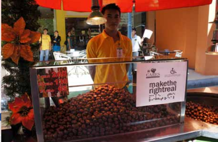
▶ Vendors in the Mall of Asia Joined the Campaign