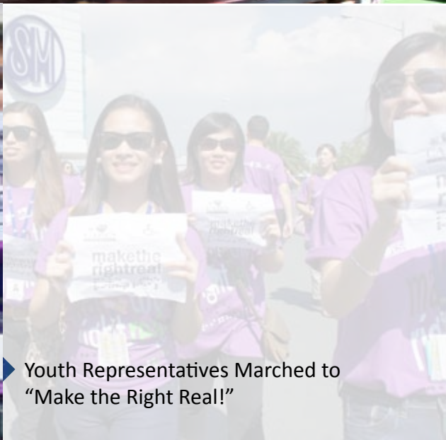
▶ Youth Representatives Marched to "Make the Right Real!"