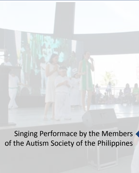
Singing Performance by the Members of the Autism Society of the Philippines