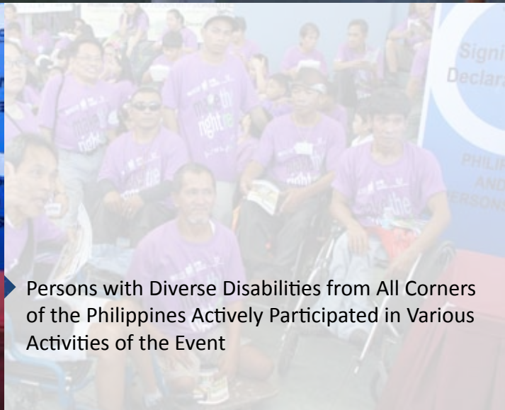
Persons with Diverse Disabilities from All Corners of the Philippines Actively Participated in Various Activities of the Event