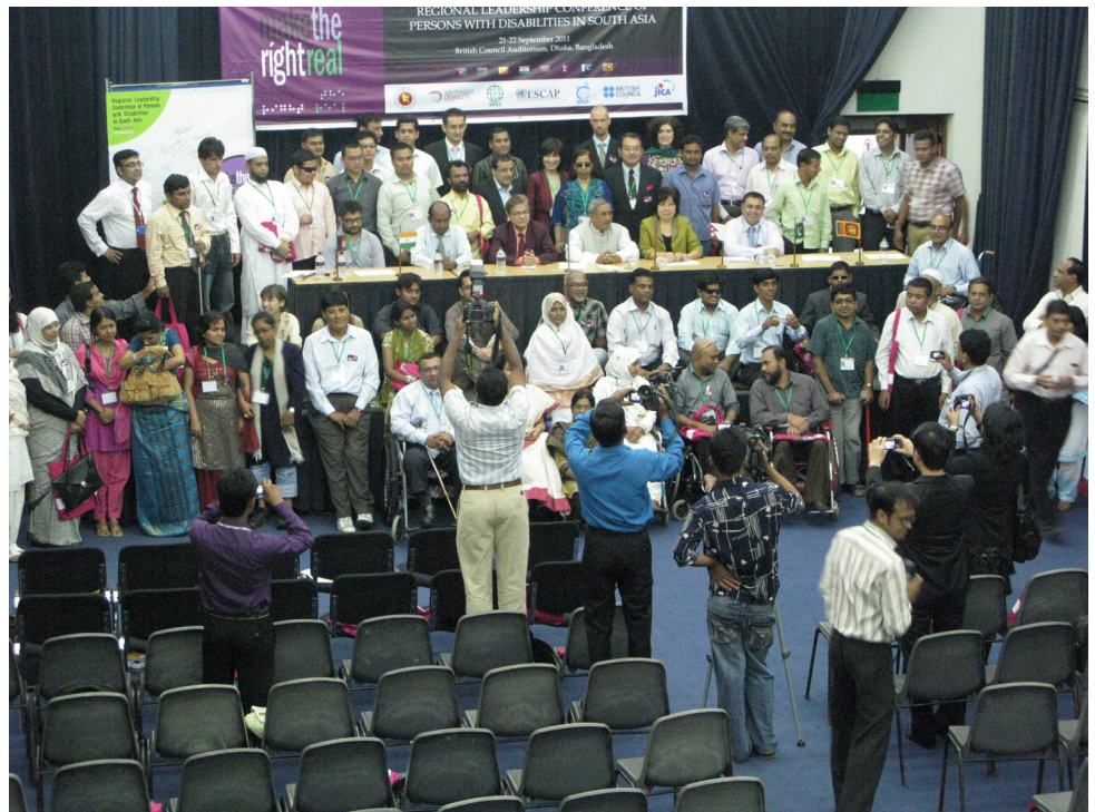
Group Photo in the Opening Ceremony