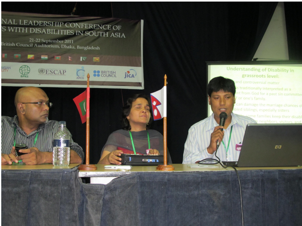
Reviewing the Second Asian and Pacific Decade of Disabled Persons, 2003-2012