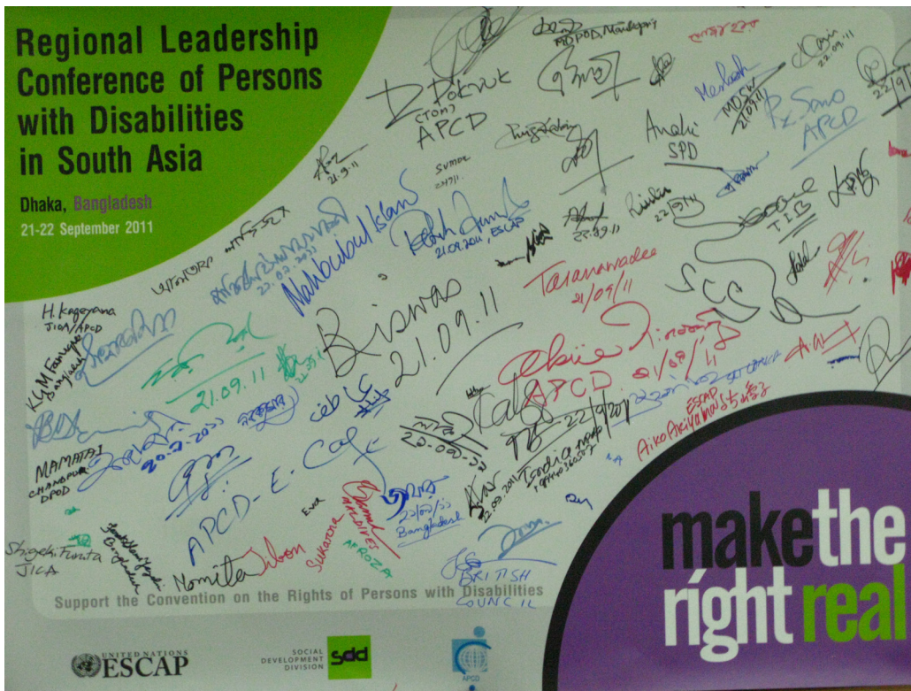
Participants Support Make the Right Real Campaign