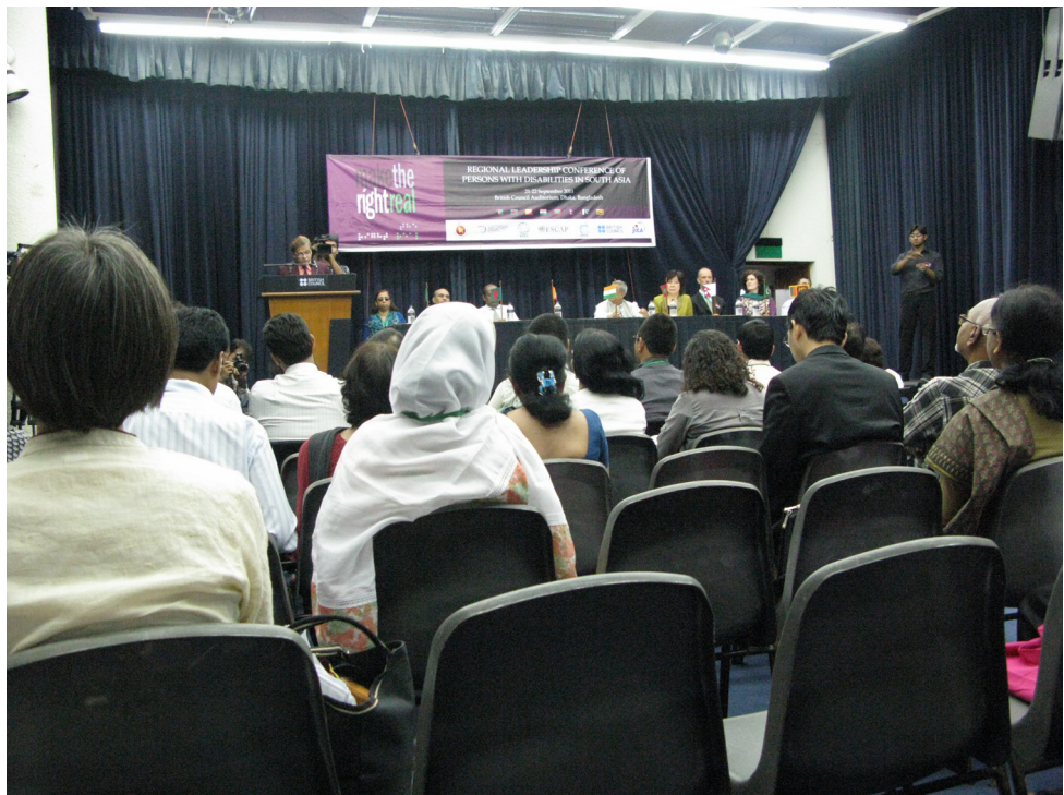
About 100 Delegates Participating in the Conference