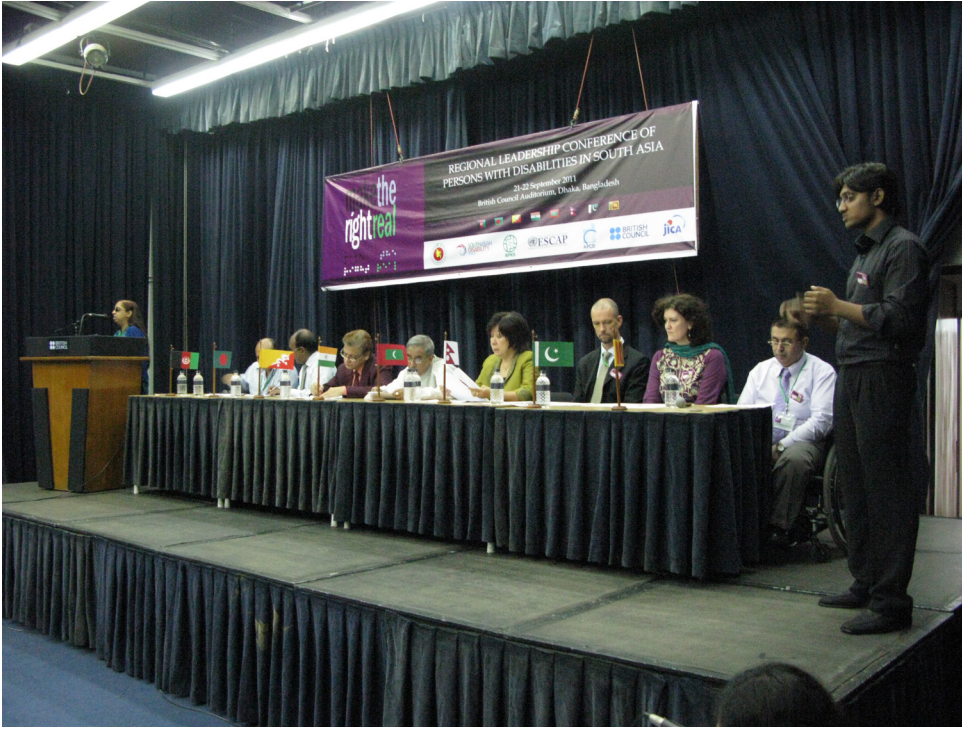
Organizers Welcoming Participants