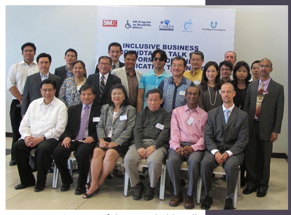
Participants of the Roundtable Talk

With more than 20 business practitioners as well as leaders with disabilities, the "Inclusive Business Roundtable Talk on ICT (Information and Communication Technologies)" was jointly organized by the SM Supermalls, APCD and TNF at SMX Convention Center in Manila, the Philippines, on 29 September 2011.