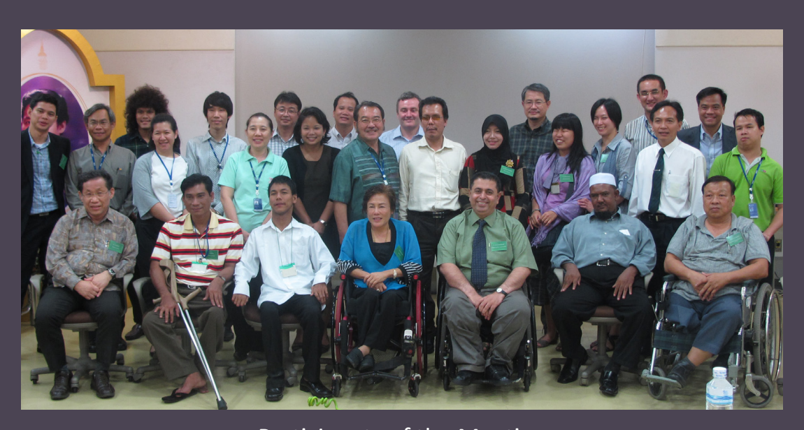
Participants of the Meeting

One of the major outcomes of the Meeting was to gain further insight on how to include persons with disabilities in the business context, particularly in comparison with CSR concept. The following chart illustrated the viewpoint of conventional CSR and disability-inclusive business. As is in the below chart, one clear consensus in the roundtable talk was to emphasize the need of paradigm shift from the vertical way to the horizontal way.