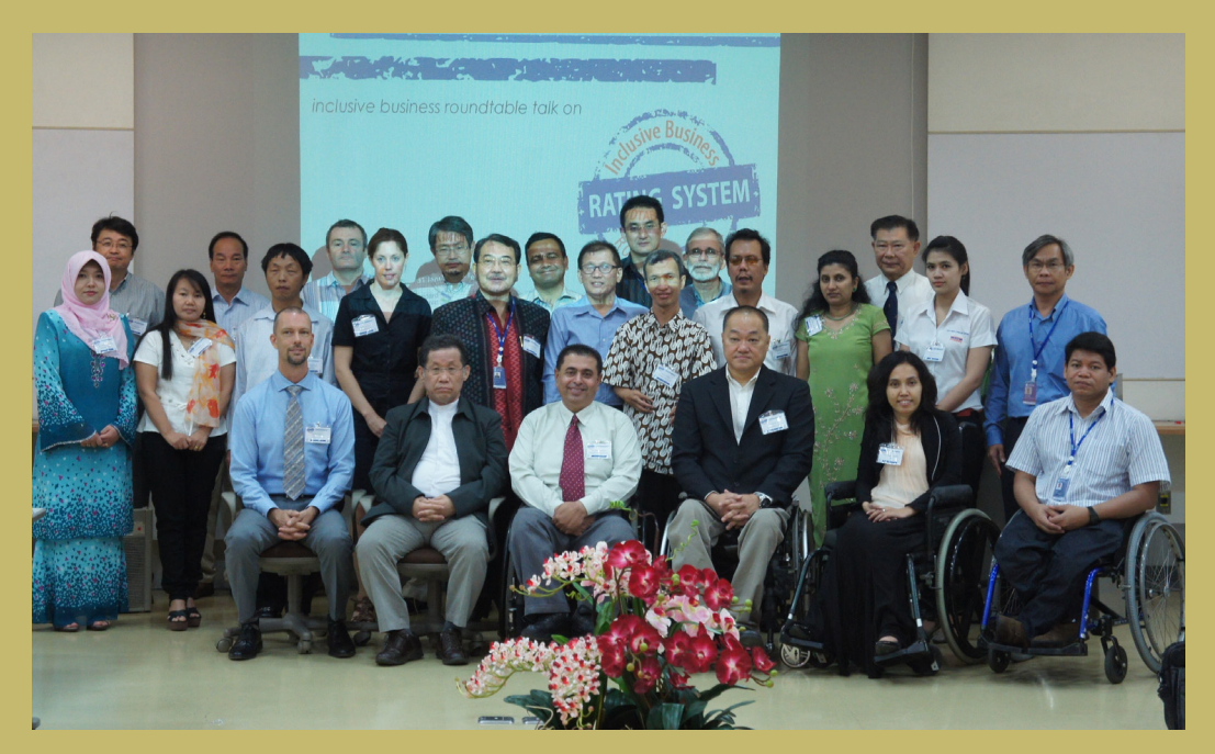
Participants of the Roundtable Talk

In line with the findings of the previous meetings, the "Inclusive Business Roundtable Talk on Rating System" was jointly organized by APCD and TNF at APCD Training Building in Bangkok, Thailand, on 31 January and 1 February 2012. Participants included the United Nations ESCAP, Charoen Pokphand Group of Thailand and other business entities.