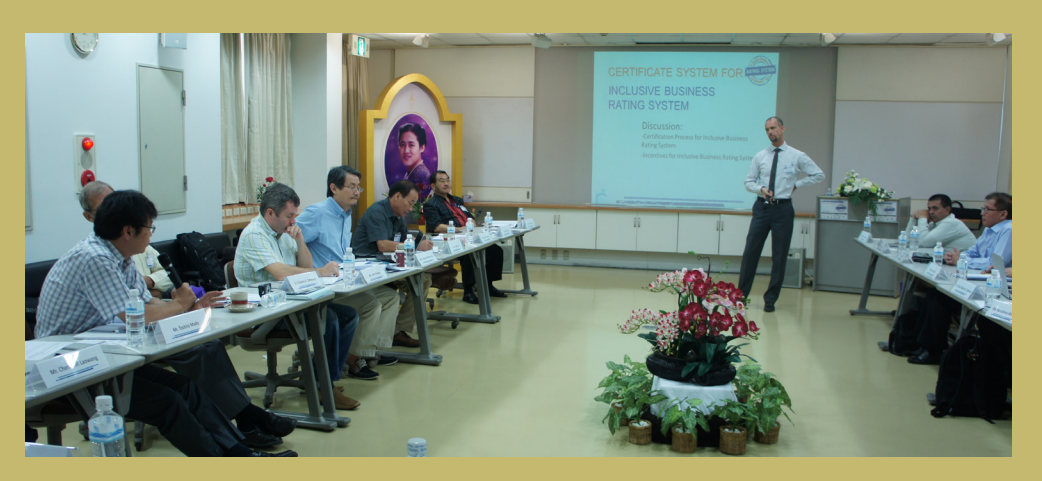
Participants Elaborating the Future Direction