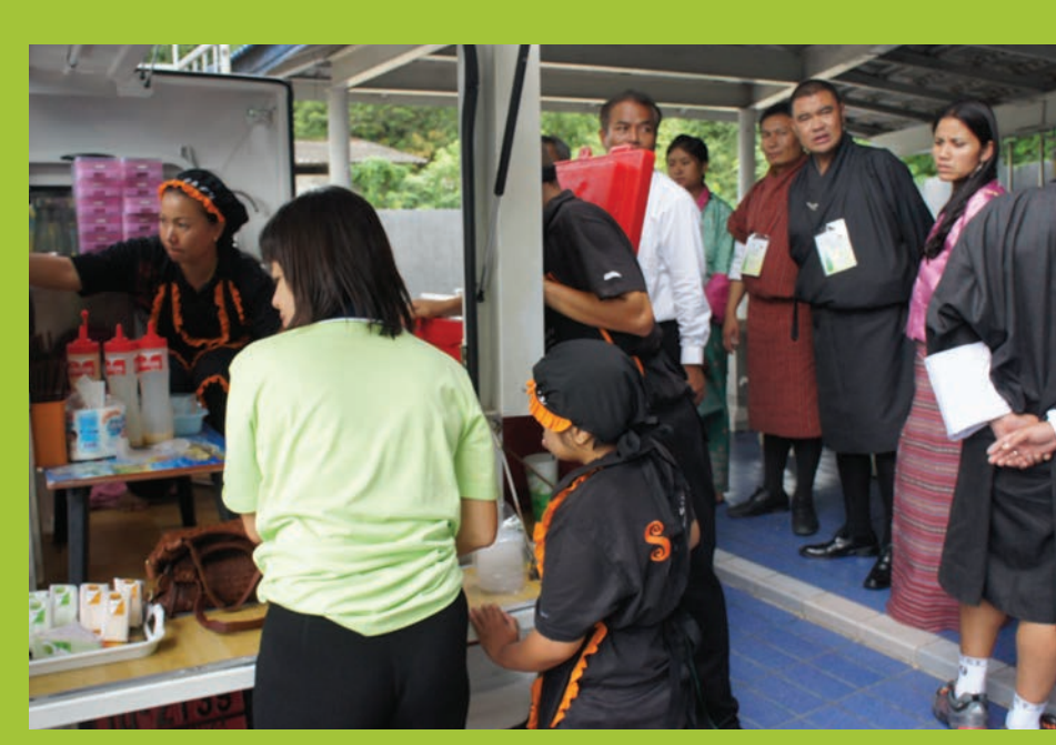
Observation on Income Generation Activities