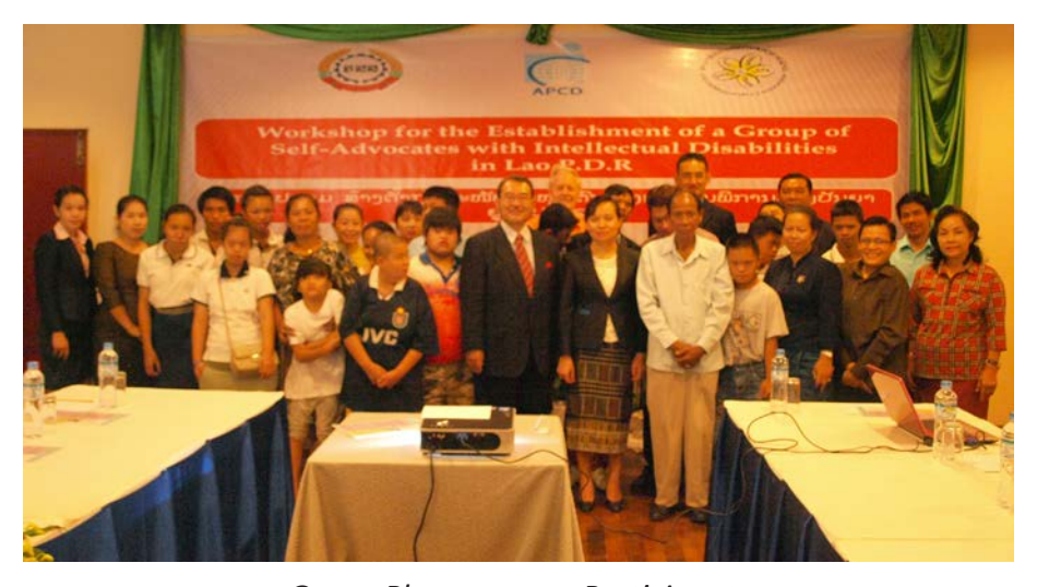
Group Photo among Participants

Thirty-five workshop participants were fruitfully accomplished the goal of the one-day workshop for the 'Establishment of a Group of Self-Advocates with Intellectual Disabilities in Lao PDR', that was intended to form the first Self-Advocate Group with Intellectual Disabilities in Lao PDR, and to promote collaboration among five countries (Lao PDR, Cambodia, Myanmar, Thailand and Vietnam).