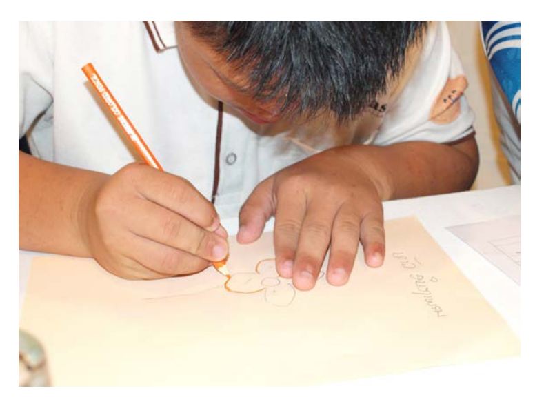
A Drawing of the Logo for the Talent Group