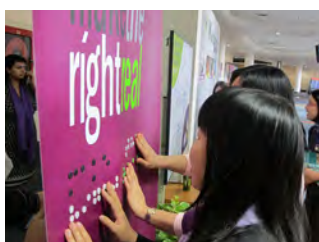
Accessible Roll-Up Developed by APCD