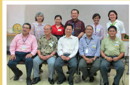
AAN Executive Committee Members