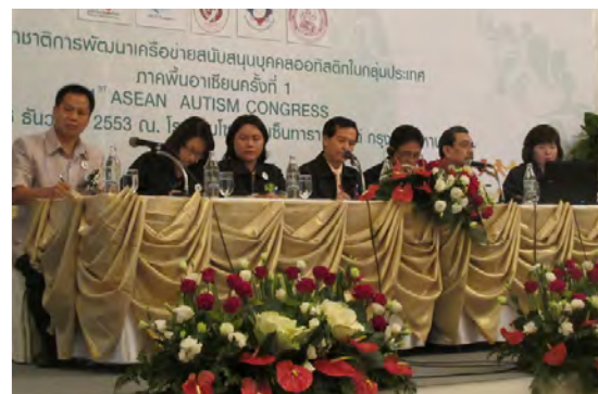
Presentation by Participants from ASEAN Countries