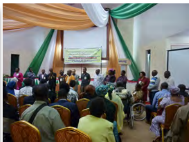
African Participants Discussing CBR Practices