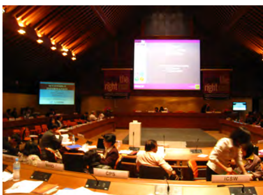
Accessible Information Supported by IDPP Project (APCD / The Nippon Foundation)

The High-level Inter-governmental Meeting on the Final Review of the Implementation of the Asian and Pacific Decade of Disabled Persons (2003-2012) is going to be held in late October 2012 in Incheon, the Republic of Korea.