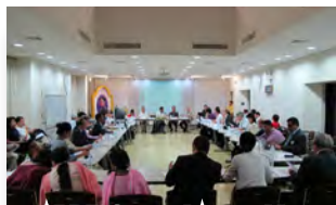
APDF General Assembly

Following the “Asia and Pacific Disability Forum (APDF) Executive Committee Meeting” and “APDF General Assembly” on 17 October 2010, the “APDF Conference” was held on 18 October 2010 at the Asia-Pacific Development Center on Disability (APCD) Training building in Bangkok. The Conference was designed to review the achievement of the 2nd Asian and Pacific of Disabled Persons, 2003-2012, in accordance with the Biwako Millennium Framework for Action (BMF) and the Biwako Plus Five.