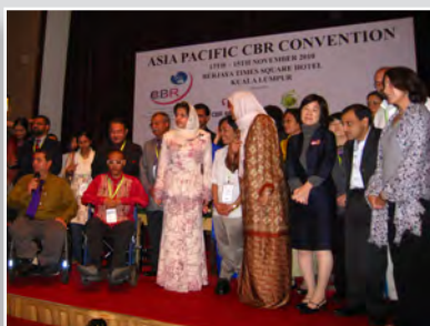
Minister Y.B. Senator Dato' Seri Shahrizat Abdul Jalil and Participants in the Closing Ceremony