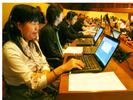
Captioning Available for the First Time at UNESCAP Meeting