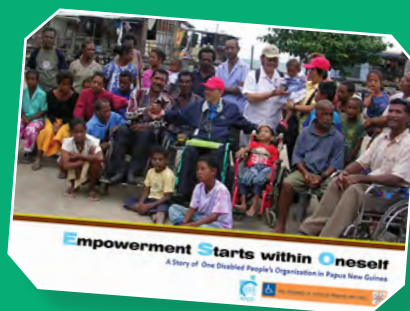
Empowerment Starts within Oneself