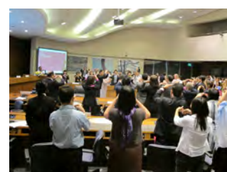
Sharing the Slogan "Make the Right Real" in Sign Language