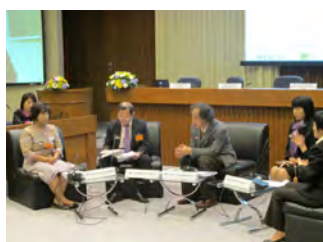
Roundtable Discussion on the Rights of Persons with Disabilities