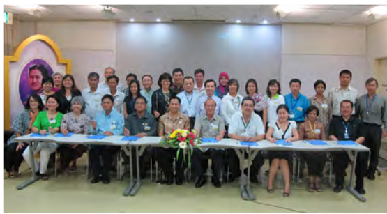
Parents of Persons with Autism Participating in the ASEAN Autism Workshop

Representatives from nine of the ASEAN countries were honoured when Her Royal Highness Princess Ubolratana Rajakanya presented trophies to them in recognition of their efforts. The second ASEAN Autism Congress is scheduled to be held in 2012 in Brunei Darussalam, followed by the General Assembly of the ASEAN Autism Network (AAN) which was just established in the ASEAN Autism Workshop organized by APCD.