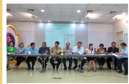
Constitution Adopted by AAN

APCD pledges to support this family network and keep up the spirit of, “Act for Autism Now!” In addition, APCD, as the Secretariat of AAN, will continue to collaborate and support this movement to further develop and promote the quality of life for persons with autism and their families in the ASEAN region.