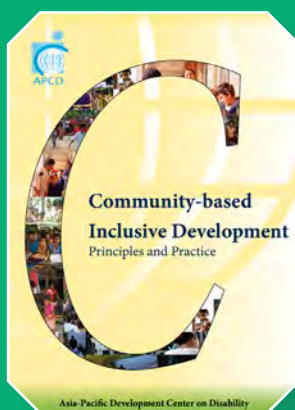
Community-based Inclusive Development Principles and Practice