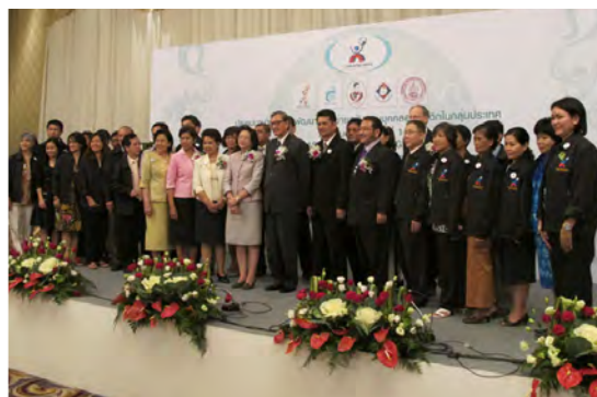
Opening of the Congress

Three hundred persons, including parents and family members of persons with autism from the Association of Southeast Asian Nations (ASEAN) Member States, participated in the first ASEAN Autism Congress in Bangkok, Thailand from 16-17 December 2010. The Congress was organized by the Khun Poom Foundation and the Association of Parents of Thai Persons with Autism in collaboration with the Ministry of Social Development and Human Security of Thailand, the Asia-Pacific Development Center on Disability (APCD) and the Japan International Cooperation Agency (JICA).