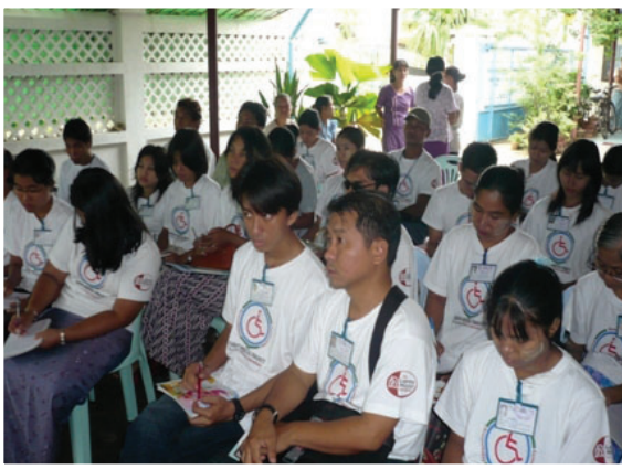
Participants of CDD training

The overall goal of our “Centre for Disability in Development (CDD)” is to promote a new understanding on disability, the social model since we believe that understanding the social aspects of disability can positively impact the life of persons with disabilities (PWDs) according to the global community. CDD is trying to share this new perspective through various kinds of disability-related trainings such as “Disability Awareness Training (DAT)”, “Disability Equality Training (DET)”, “Community-based Rehabilitation (CBR)” and “Disability and Development Training (D & D)” as core trainings. Other trainings such as “Basic Care Giver Training”, “Volunteer Training”, “Inclusive Education Training” and “Independent Living Training” may be implemented.