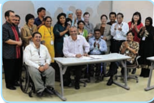
Regional Council Members

We believe that you still have a vivid memory of the enthusiasm and commitment of the participants at the 1st Asia-Pacific CBR Congress in February 2009 to promote community-based rehabilitation (CBR) which led to the establishment of the CBR Asia-Pacific Network (the Network). Representatives from 18 countries/territories met at APCD on 14-16 December 2009 to discuss key issues to set the Network in motion.