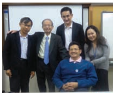
Professor Nonaka and APCD's team

The essence of KM is not "Managing Knowledge" but "Knowledge-based Management", or "Knowledge Creation Management". The origin of knowledge can be initiated by BA: time, space, and relationship including the dialogue or discussion among people with different backgrounds. Through the dialogue and discussion, we can learn from each other by exchanging experiences, or what we call, tacit knowledge. In this sense, "process" is more important than "product" since "process" is action-oriented. Innovation can be initiated from "out-of-box" approach. The documentation method through SbKM can be developed in line with this essence.