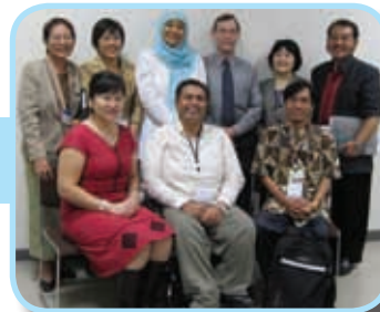
Executive Committee Members

Nam. Also present were the organizing secretaries of the 2nd Asia-Pacific CBR Congress to be held in the Philippines in 2011 and the CBR World Congress to be held in India in 2012. In addition, observers from Brunei Darussalam, India,