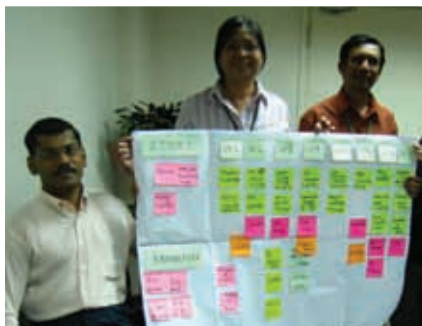
After SbKM Workshop

An approach by the Barrier-Free Environment and Accessible Transport Group (BEAT) is very interesting in that its work is practical collaboration with corporate sectors. Key leaders, who have joined APCD training in the past, are now resource persons of disability-related training at private companies. Particularly, the Malaysian Association for the Blind (MAB), Persatuan Mobiliti Selangor & Kuala Lumpur, United Voice (Self-Advocacy Society of Persons with Learning Disabilities Selangor & Kuala Lumpur) and Young Men's Christian Association of Kuala Lumpur are very powerful as resource persons at Air Asia Academy (staff training institute of the low-cost air-career company in Asia). From the viewpoint of cross-disability, key leaders with disabilities/organizations plan to develop a document as a Story-based Knowledge Management (SbKM) activity in collaboration with APCD in 2010.