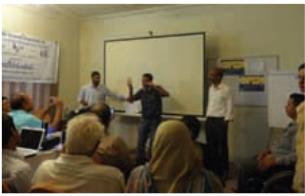
SbKM Workshop attended by PWDs

It is not new for us to share our story. But we never thought about “creating a story document with our knowledge” until APCD facilitated Danishkadah in developing our own document. It was exciting for us to know the Story-based Knowledge Management (SbKM) approach in collaboration with APCD. Initially it seemed very easy to just shoot some interviews but it proved otherwise. Unlike other reports or documents, we soon realized that it was a big project since we needed to utilize our own knowledge, effort and resources. Finally, it was decided to produce a story book in a cartoon format, with a deaf cartoonist.