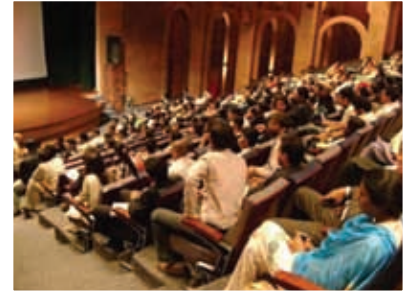
Launching Ceremony in Islamabad

One endeavour of STEP as a Story-based Knowledge Management (SbKM) project was launched in conjunction with observing International White Cane Safety Day on 14 October 2009. Over 500 persons from all walks of life attended the event. The video documentary was completed in collaboration with the National Institute of Science and Technical Education under the Ministry of Education (MOE), the Ministry of Social Welfare and Special Education (MSWSE), Sightsavers International Pakistan (SSI Pakistan), JICA and APCD.