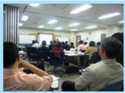
Participants from APCD