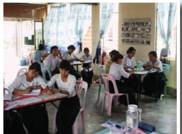
Training on Inclusive Education

In Myanmar, the understanding of disability is generally the medical model. The number of disability-related organizations is less than other developing countries. Services to meet the basic needs of PWDs are still inadequate.