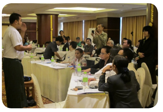
Sharing Good Practices by Each Participant

Participants shared their experiences of good practices in promoting SHOs and Inclusive Development and exchanged information on the progress of implementation of the CRPD, MDGs and BMF+5. They also began to understand the ASEAN mechanism. SHOs on Autism from Brunei, Myanmar, the Philippines, Thailand and Vietnam agreed to establish an ASEAN Autism Federation.