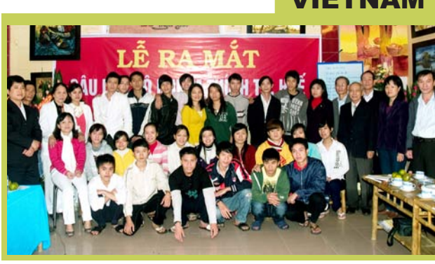
Opening Ceremony of Hue City Club for the Deaf

With support from Disability Resource and Development (DRD), persons with hearing impair-