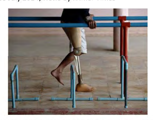
A disabled wan exercises on February 18, 2009 at the Ken Khleang Physical Februalitation center. Five year program to improve disabled people's living standard

Thursday, 03 July 2014; News by Khmer Times