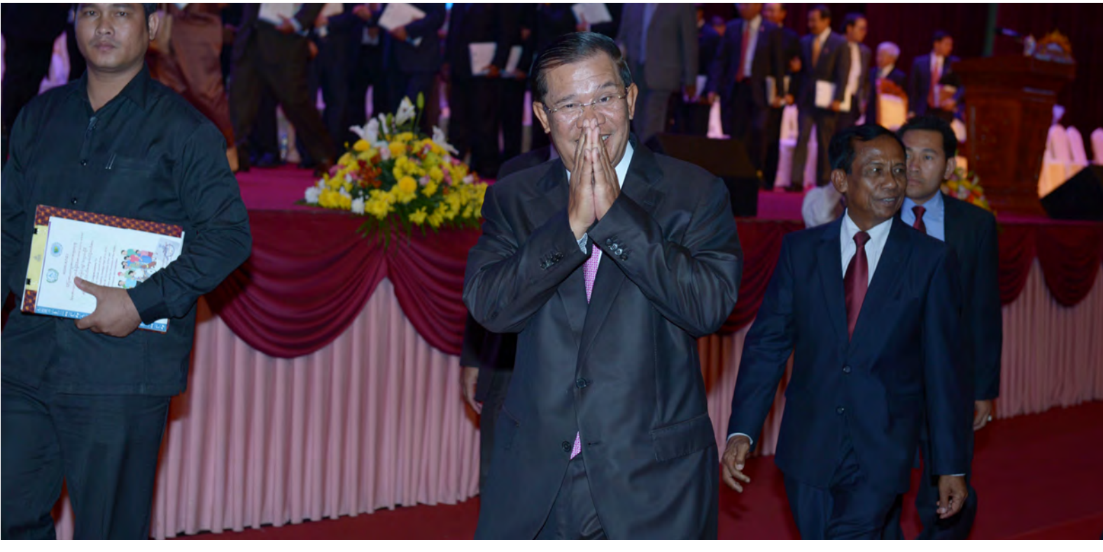
Departure of H.E. Samdech Akka Moha Sena Padei Techo HUN SEN