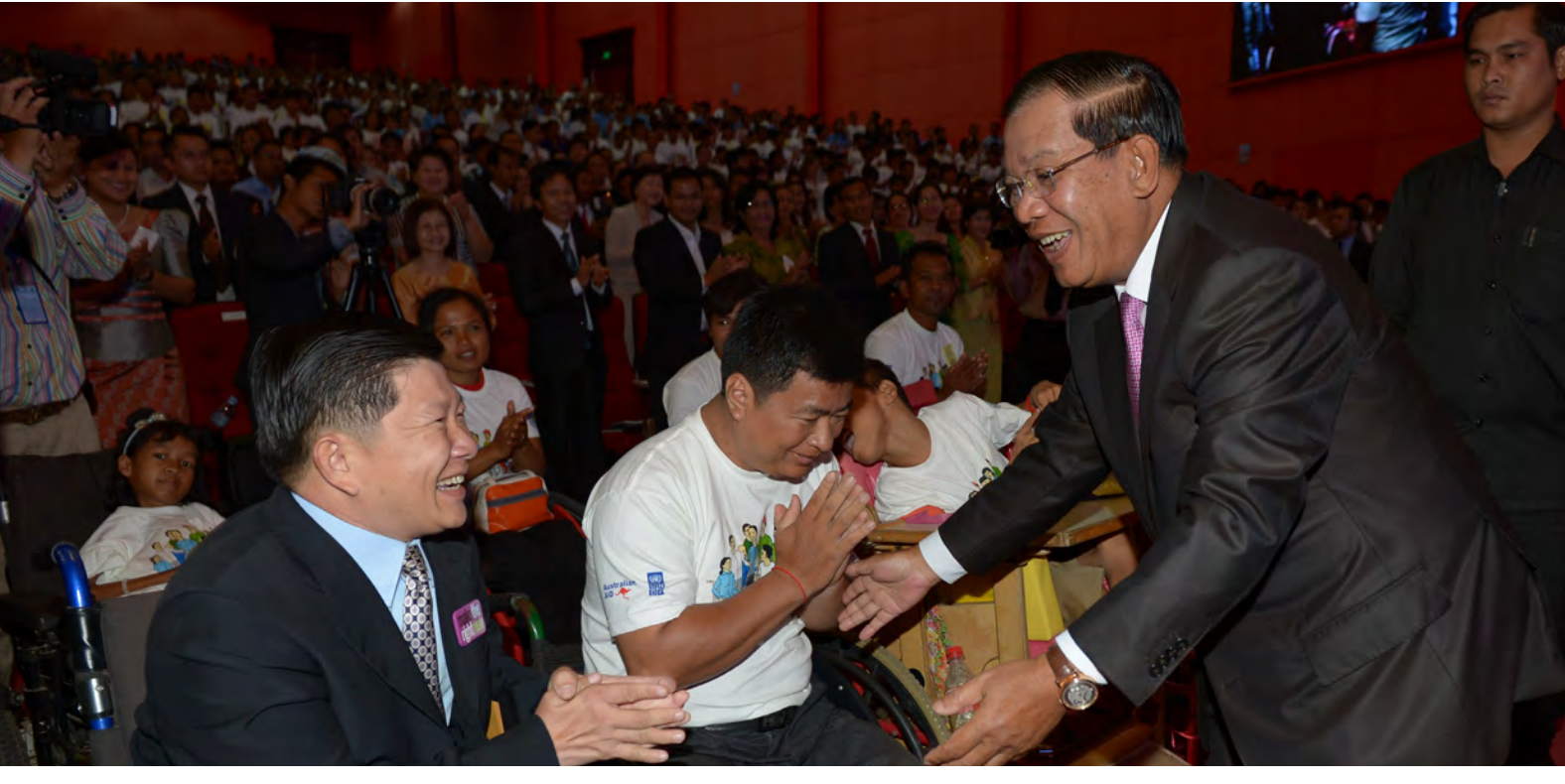
H.E. Samdech Akka Moha Sena Padei Techo HUN SEN greeted participants