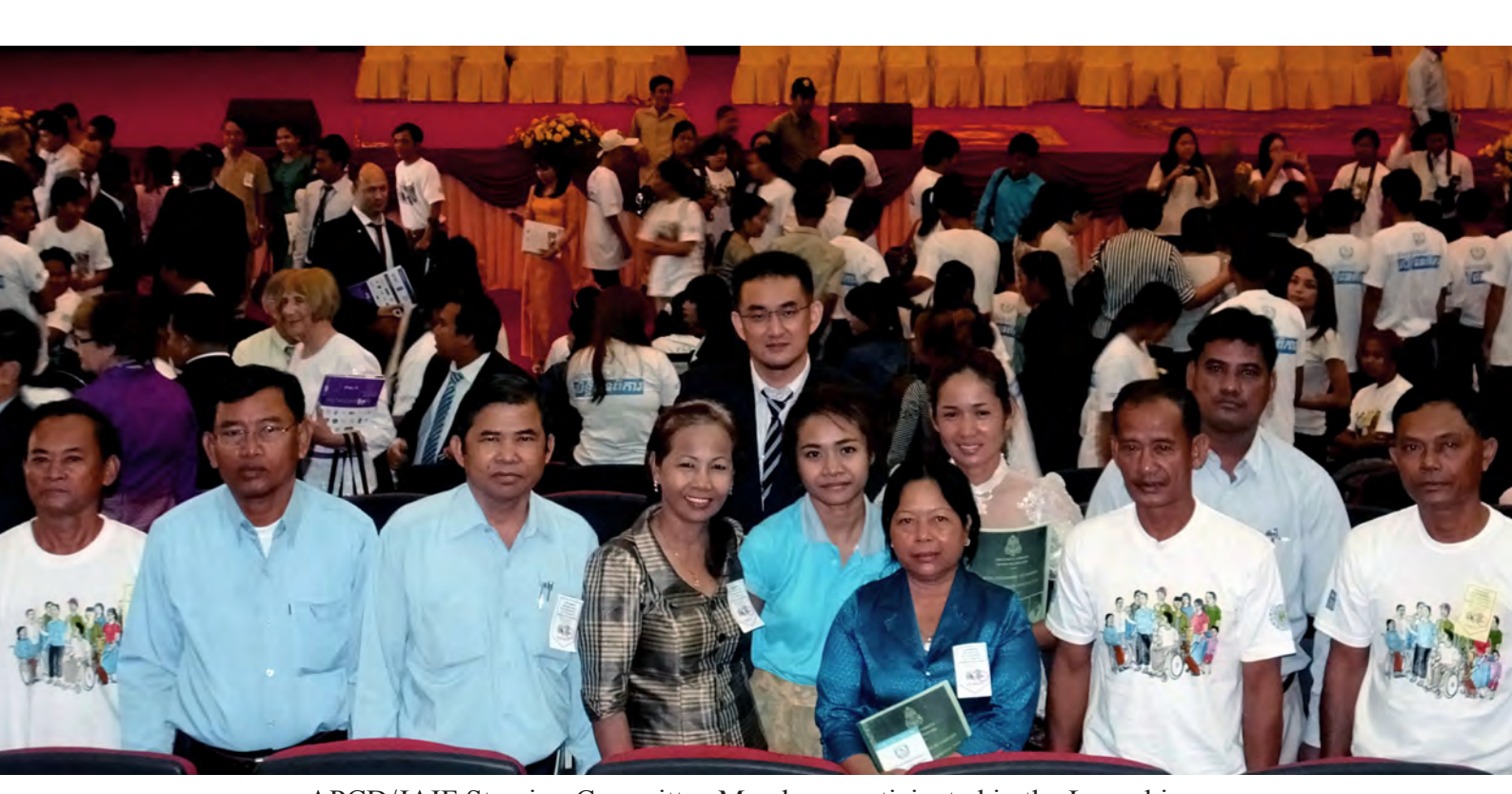
APCD/JAIF Steering Committee Members participated in the Launching