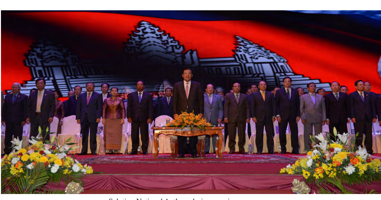
Saluting National Anthem during opening ceremony