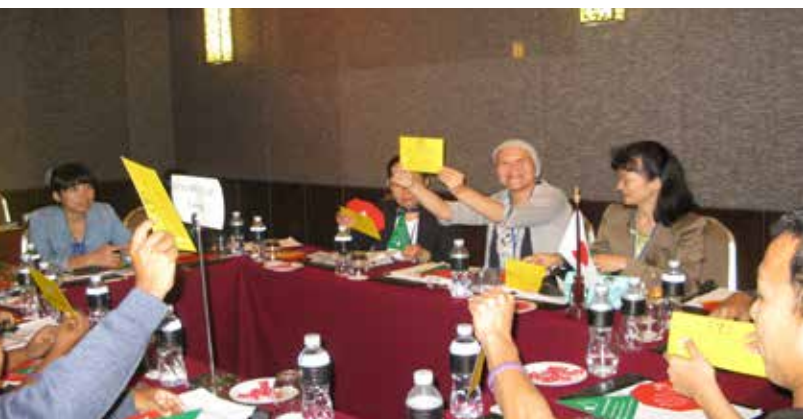
Yellow Card: To Ask Speaker to Slow Down or Ask a Question or Talk to Supporter