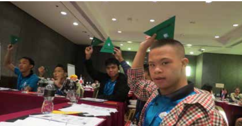
Green Card: To Agree with the Speaker or Say “Yes” to the Speaker