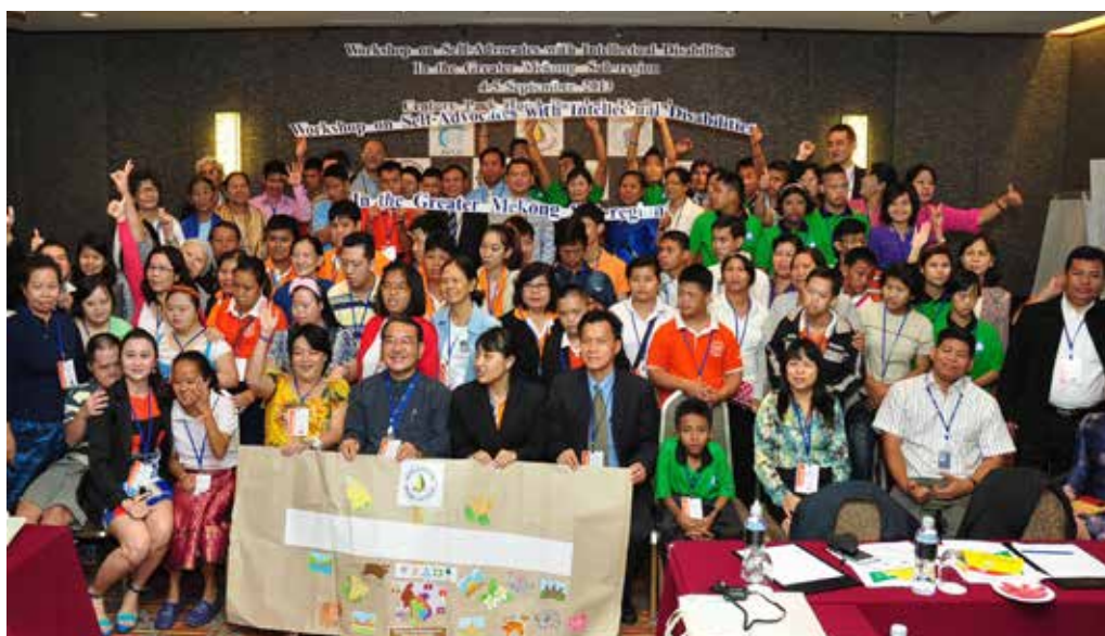
Group Photo among Self Advocates with Intellectual Disabilities, Parents and Supporters

The Workshop was attended by 98 participants representing the persons with intellectual disabilities and their family members in the Greater Mekong Sub-region, specifically Rose Group of Cambodia, Talent Group of Lao PDR, Future Star Group of Myanmar, Dao Ruang Group of Thailand and My Future Group of Vietnam. Representatives from the Inclusion Japan also participated and supported the Workshop. Other participants included the government officials of Cambodia, Lao PDR, Myanmar, Thailand and Vietnam who handle social protection and welfare of persons with disabilities.