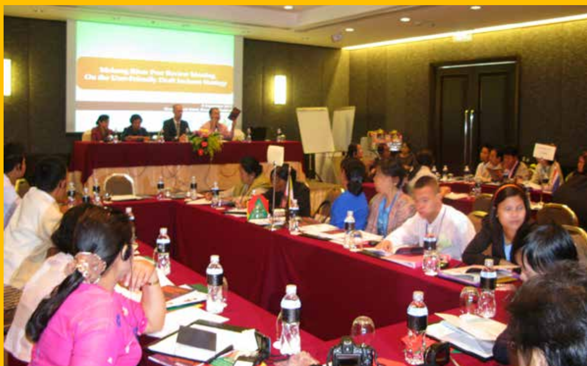
Opening Ceremony by ESCAP, APCD and the United ID Network in Mekong Sub-region