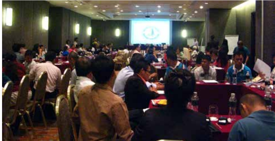
Announcement of the New Logo

The outcome of the session highlighted the Action to pursue the efforts by the in the Network as part of the participants' commitment to continuously improve the quality of their lives. Finally, the Action Plan was agreed and signed by leaders of self-advocates with intellectual disabilities in Cambodia, Lao PDR, Myanmar, Thailand and Vietnam.