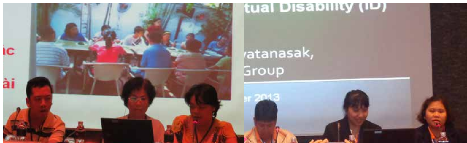
Presentations by Leaders with Intellectual Disabilities