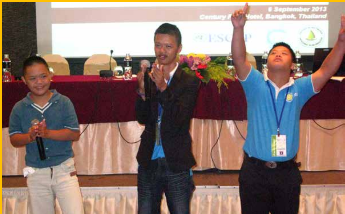
Summary of the Day (Talent Group from Lao PDR)