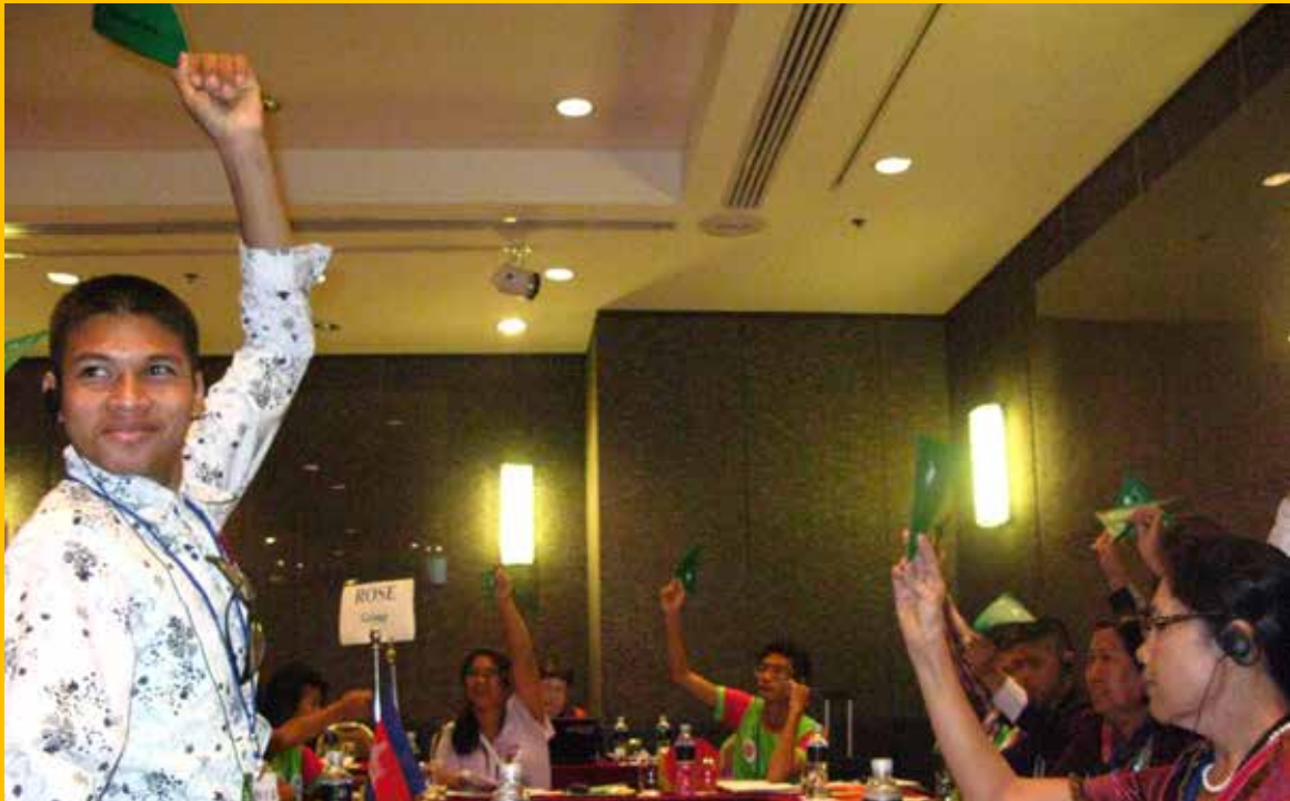
We Agree to the Contents! (Rose Group from Cambodia)