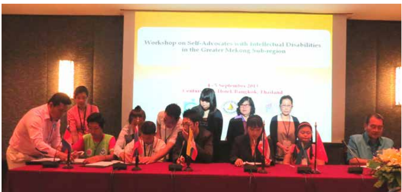
Constitution of the Network Signed by the Executive Committee Members