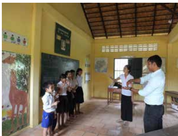
A class room at the Krousar Thmey school

- Collaborating with Krousar Thmey and the Deaf Development Program to increase the deaf students in sign language training by looking for funding from donors, information sharing by groups and organizations of persons with disabilities and relevant partners.