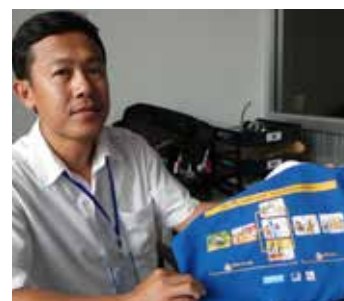
IEC material used in training by Handicap International Cambodia