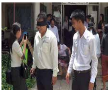
Simulation activities by training participants

- Conducting DRET and Media training to Journalists in the Vientiane Capital, Vientiane Province, Savanakheth Province and Champasack Province.