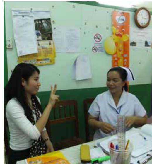
A nurse communicating with a deaf person

In addition to sign language training, AFD has been striving to revise the “First Lao Sign Language and Culture Booklet” published in 2011, to provide more opportunities for health professionals and other stakeholders to access information related to deafness.