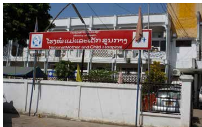
2 health professionals from 9 hospitals attending the sign language training