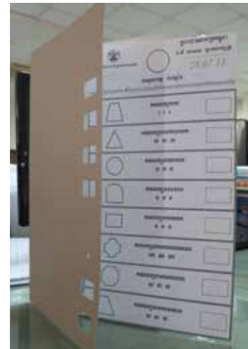
Sample ballot template used by persons with visual impairment in the election