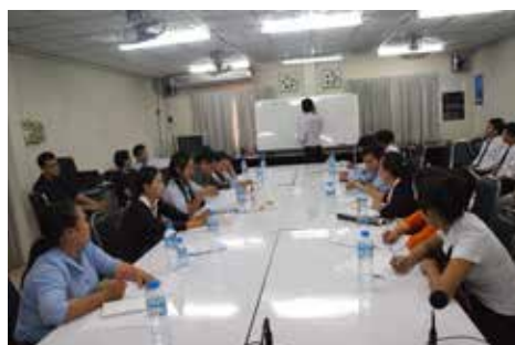
Session of Disability Rights and Equality Training

In Lao PDR there have been a variety of domestic and international non-governmental organizations working on disability and development. However, there has been no specific approach to raise awareness on disability among media people in the past. In other words, there was no access to proper information on disability from the media viewpoint.