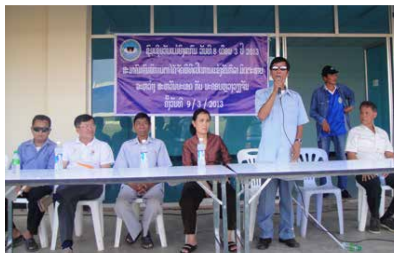
Advocacy campaign by the Lao Association of the Blind