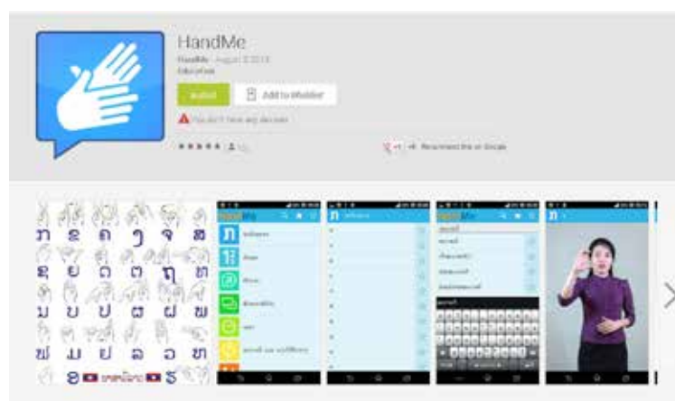
“Hand Me” downloadable for free