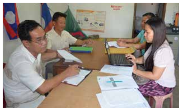
Public services by village authorities