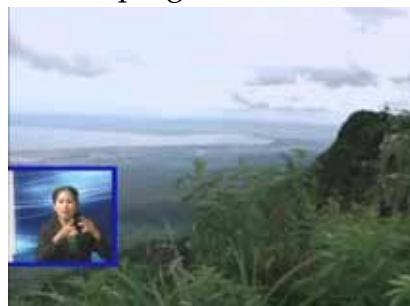
A sign language interpretation in a news program by Bayon TV

TVK started to include sign language interpretation from January 2006, following the directive from the Ministry of Information of Cambodia to provide accessible information for persons with disabilities, deaf persons in particular. Sign language interpretation is available for weekly news programs, and summary news programs of the year. Furthermore, sign language interpretation is also included in sponsored telecasts such as coverage of the national election and roundtable discussions on hot issues and concerns.