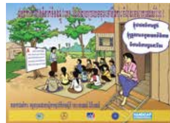
“Access to Local Awareness Raising” produced by Handicap International Cambodia

Several IEC materials have been produced by the Cambodian Disabled People’s Organisation (CDPO) for awareness-raising about disability issues and concerns, including access to information.