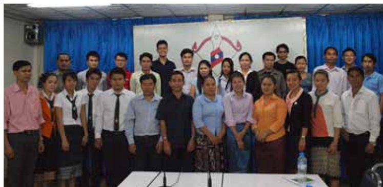
Training participants from the Lao Journalists Association