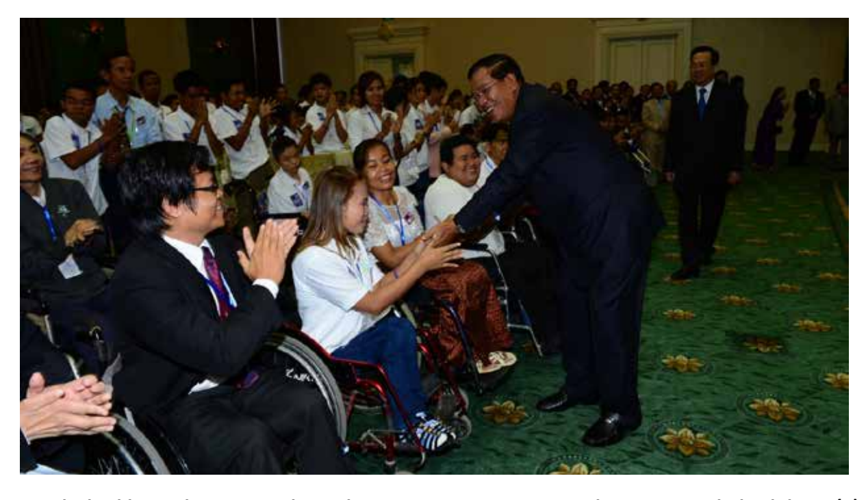
Samdech Akka Moha Sena Padei Techo HUN SEN interacting with persons with disabilities (2)