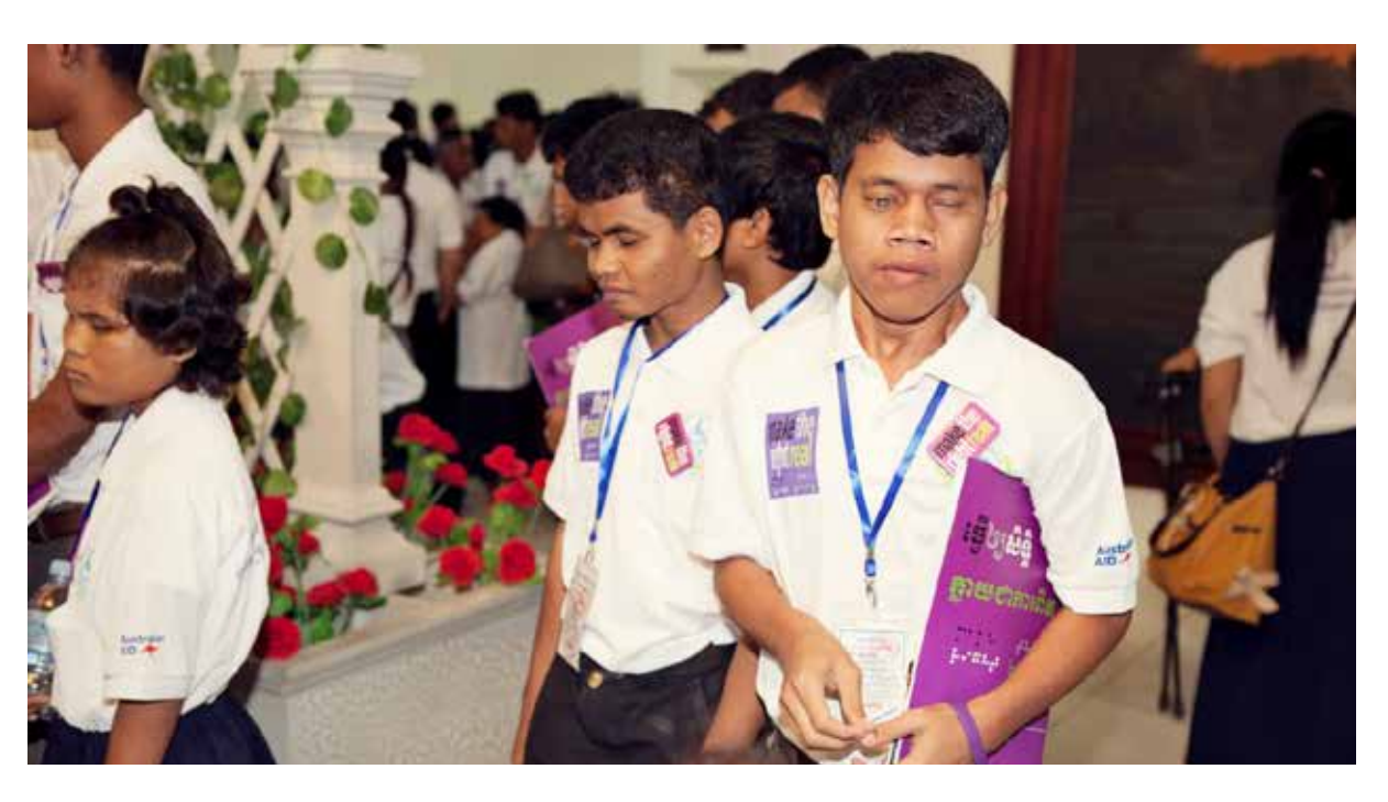
Persons with disabilities attending the ceremony (6)