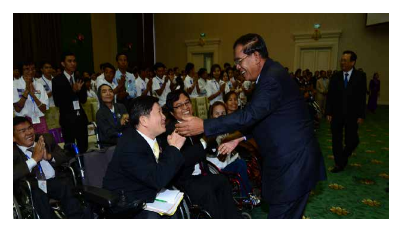
Samdech Akka Moha Sena Padei Techo HUN SEN interacting with persons with disabilities (3)