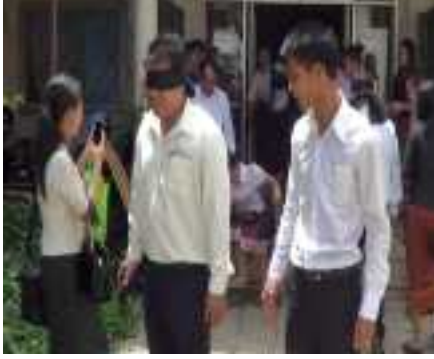
Simulation activities by training participants

- Conducting DRET and Media training to Journalists in the Vientiane Capital, Vientiane Province, Savanakhet Province and Champasack Province.