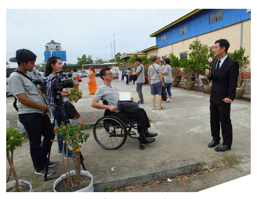
Local and international news