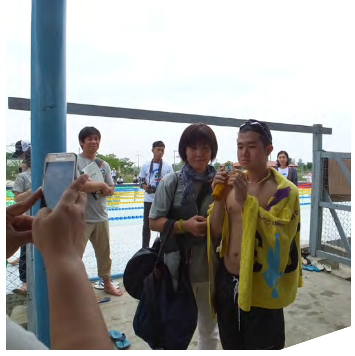
Making a spiasii in the swimming event