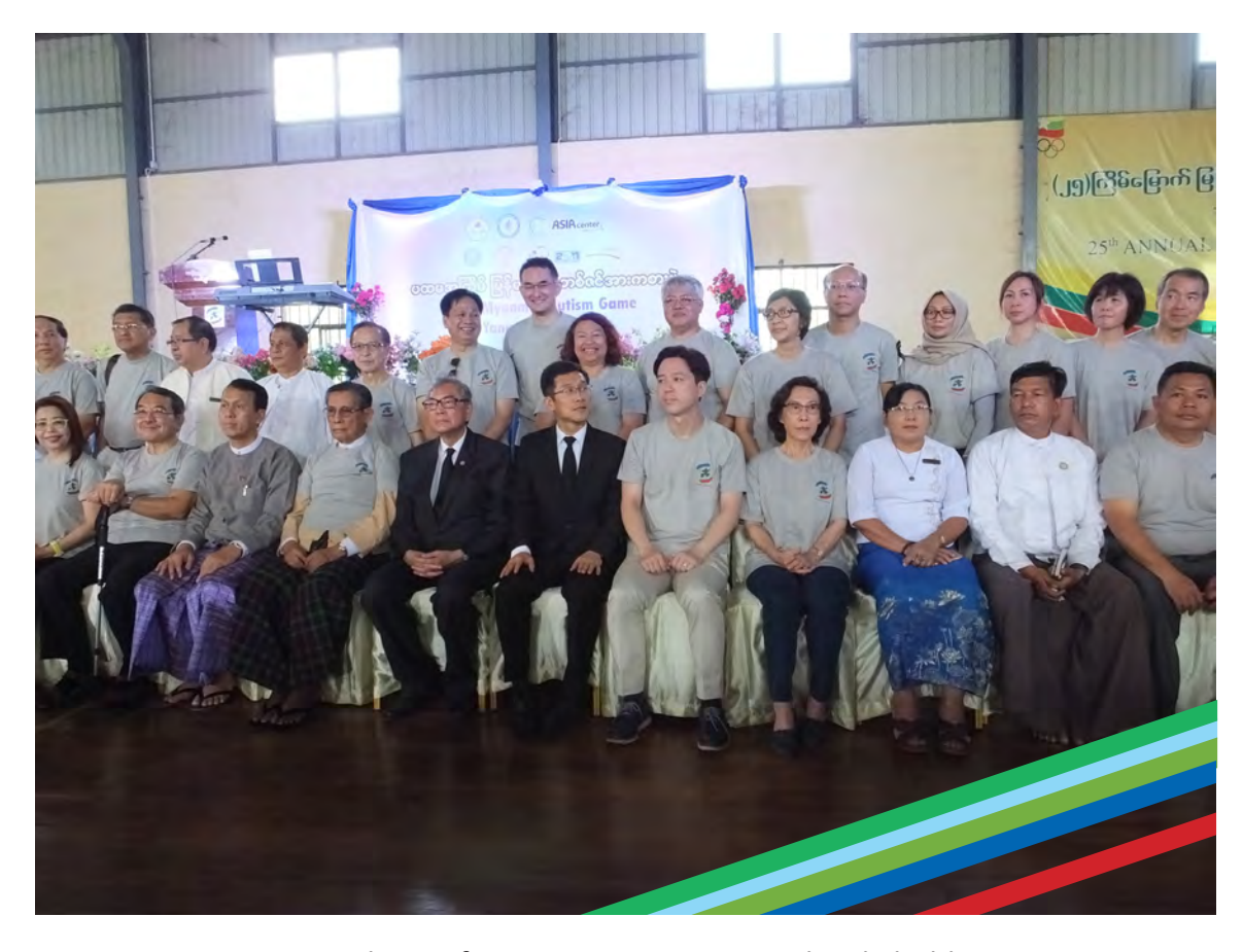
Group photo of organizers, partners and stakeholders