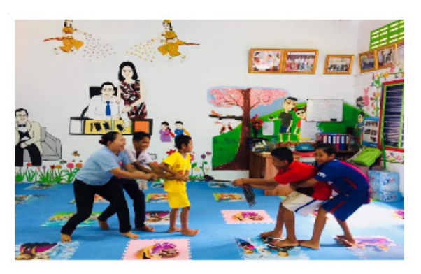
Our Big Goals