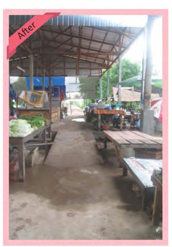
Accessible market pathway

Contact Person: Mrs. Boagat Phommachanh; Mobile: +856 20 55508640