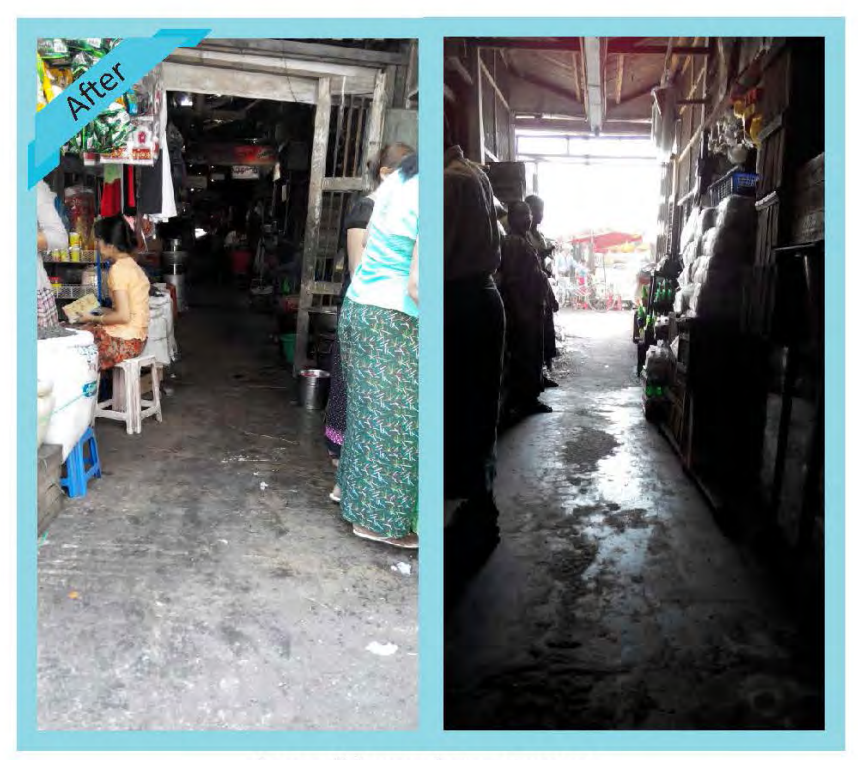
Accessible market entrances