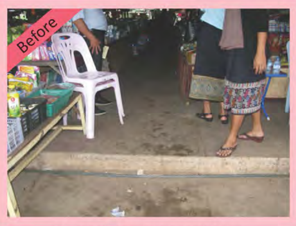
Old market entrance with steps