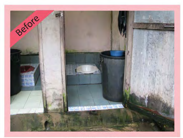
Old public toilet