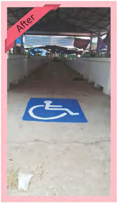
Pathways with signage