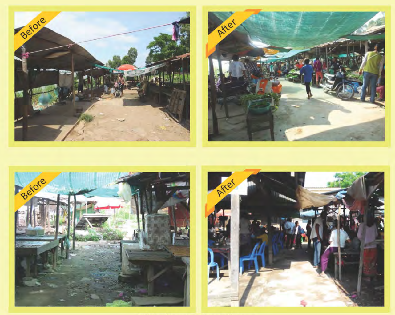
Old and new market pathways

Contact Person: Mr. Kong Punleu; Tel. +855 99868676