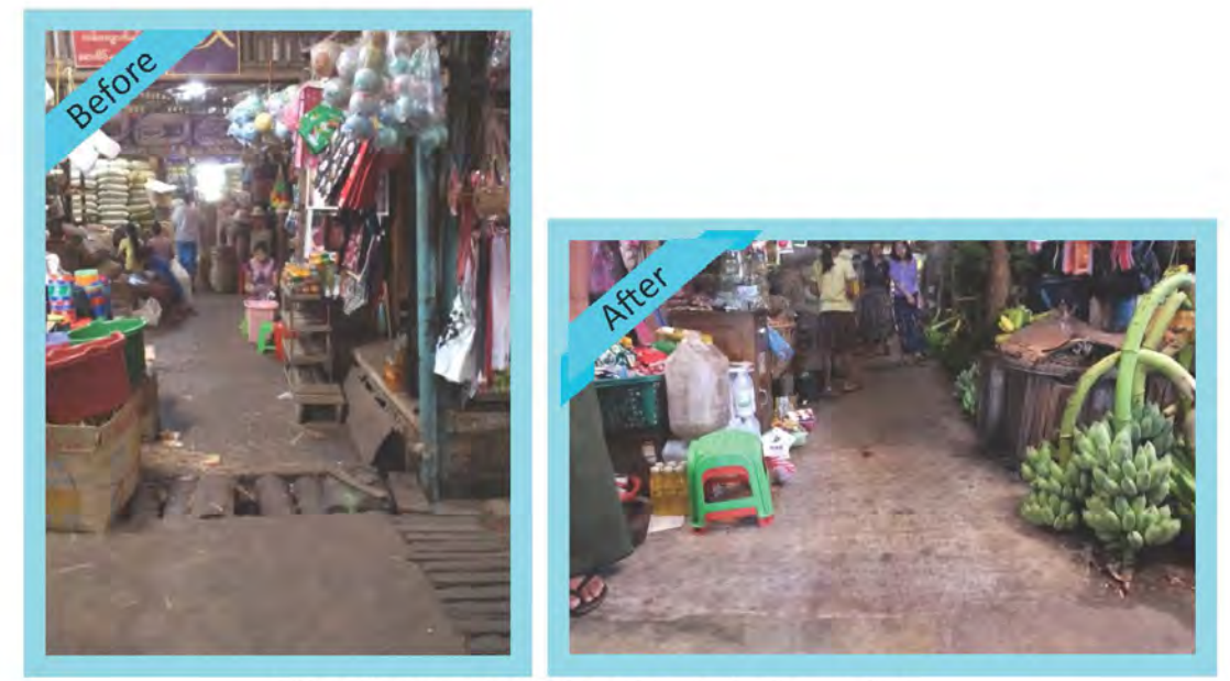
Old and new accessible pathways in the market

Contact Person: Mr. Zay Ya Ohn; Mobile: +856 20 55508640; +856 30 5367493