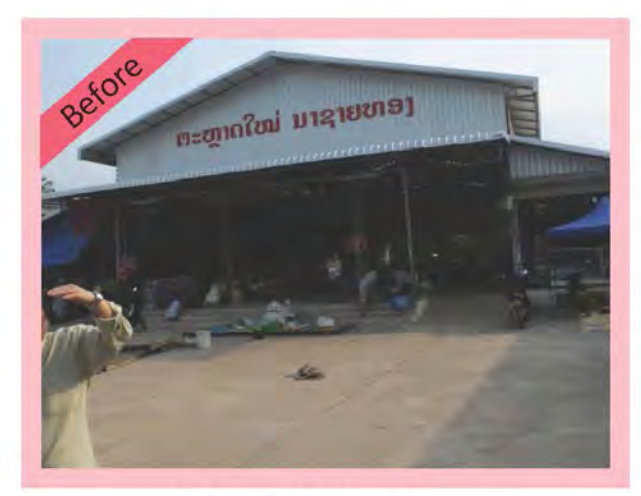
Old market entrance