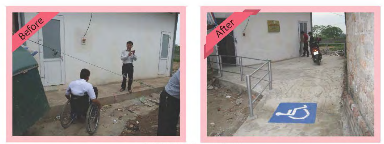
Public toilet then and now