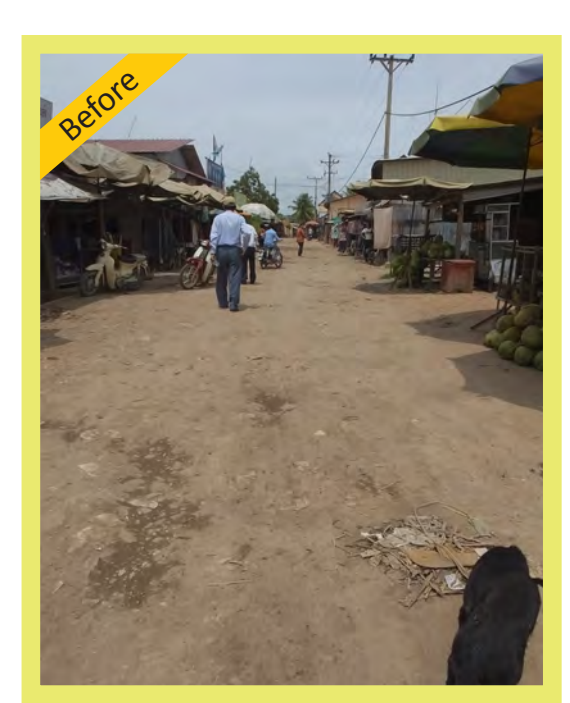
Old road in front of market