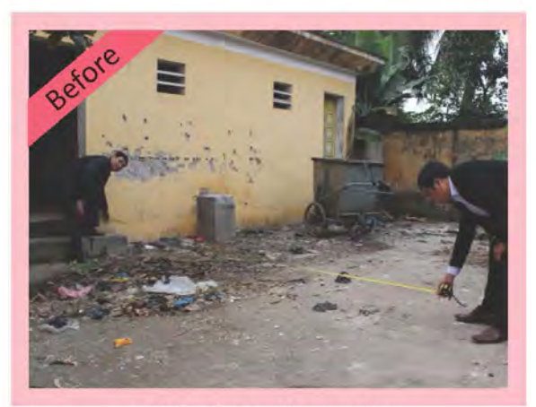
Old toilet in the market