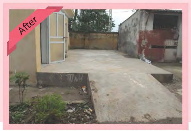
Market interior after modification