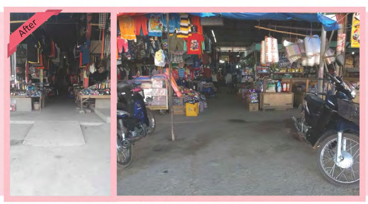
Accessible market entrance