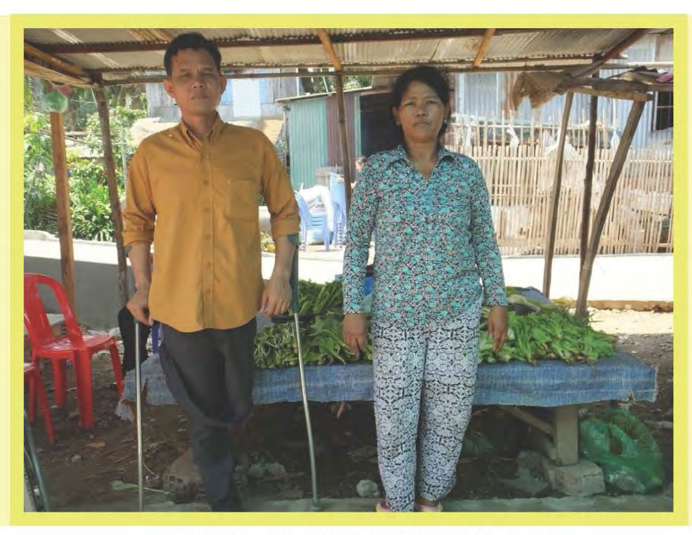
Vegetable seller with disabilities and his family