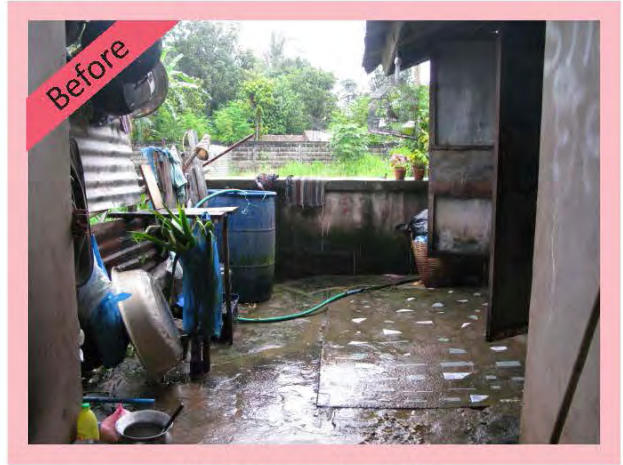
Pathway to the toilet