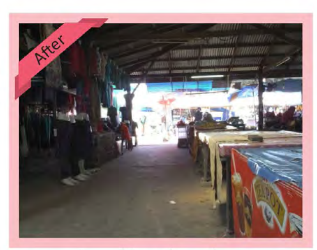
Accessible market pathway