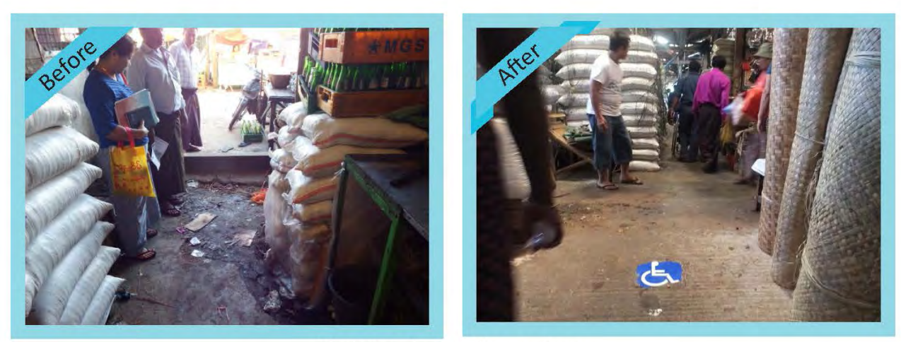
Market pathways then and now