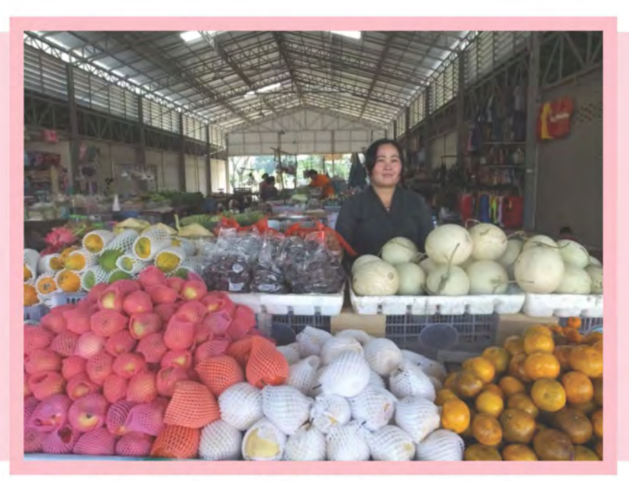
Person with disabilities selling fruits in the market