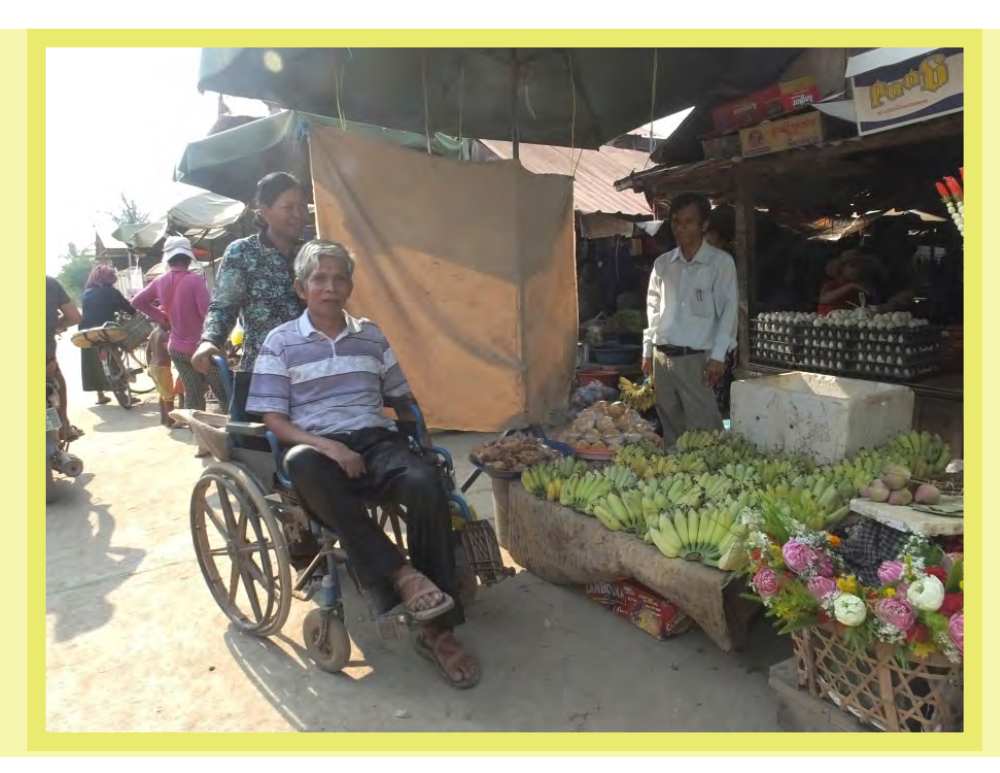
Person with disabilities and his family selling fruits in Phlou Thmey Market