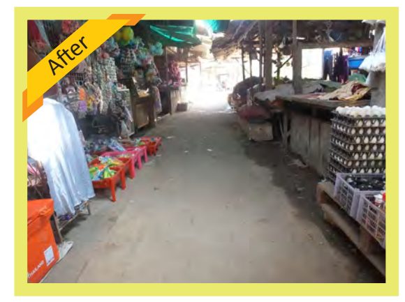
Interior market pathways then and now

Contact Person: Mr. Pich Phon; Tel. +855 1214917