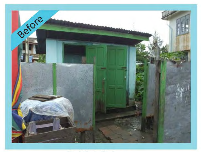
Public toilet area