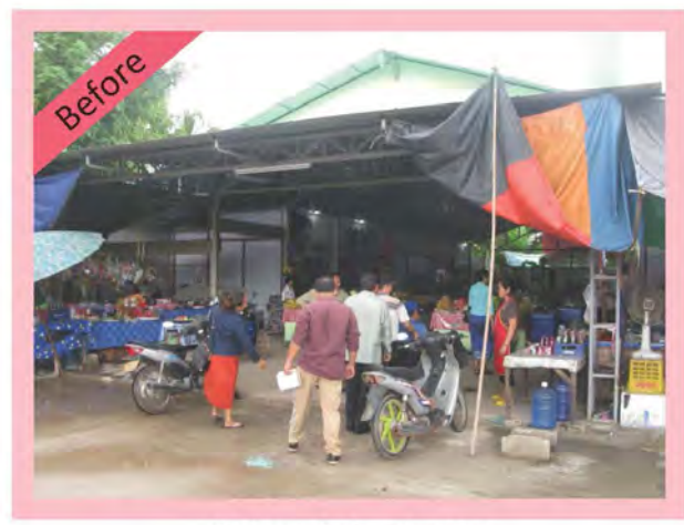
Old market entrance