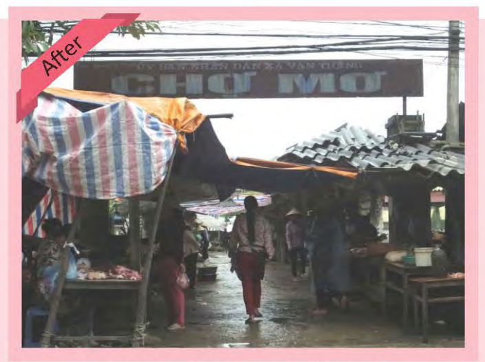
Entrance and pathways in the market