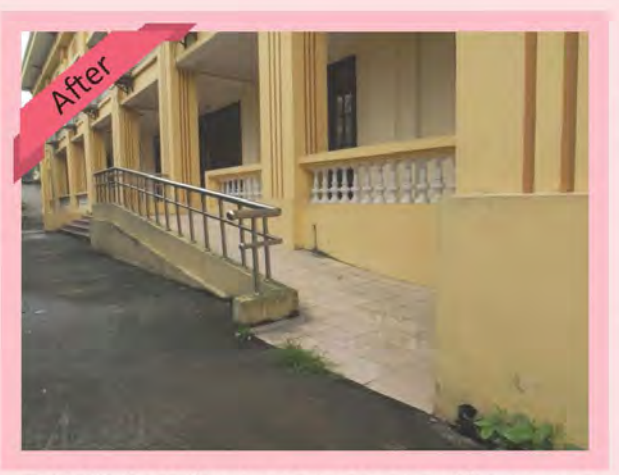
Ba Vi District conference room entrance, with two ramps at the entrance on the left and right side of the building