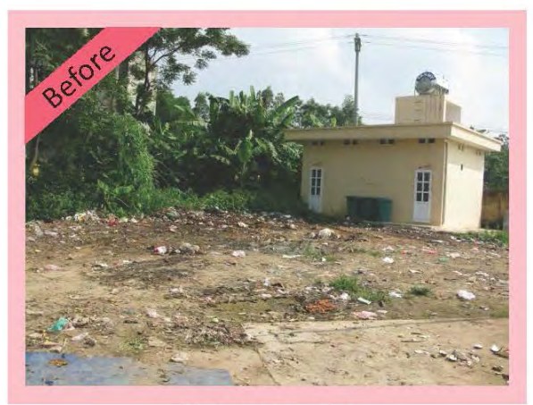
Old public toilet