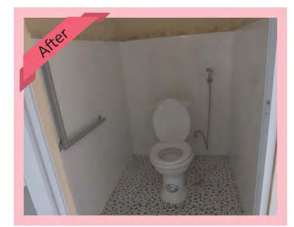
Old and new toilet