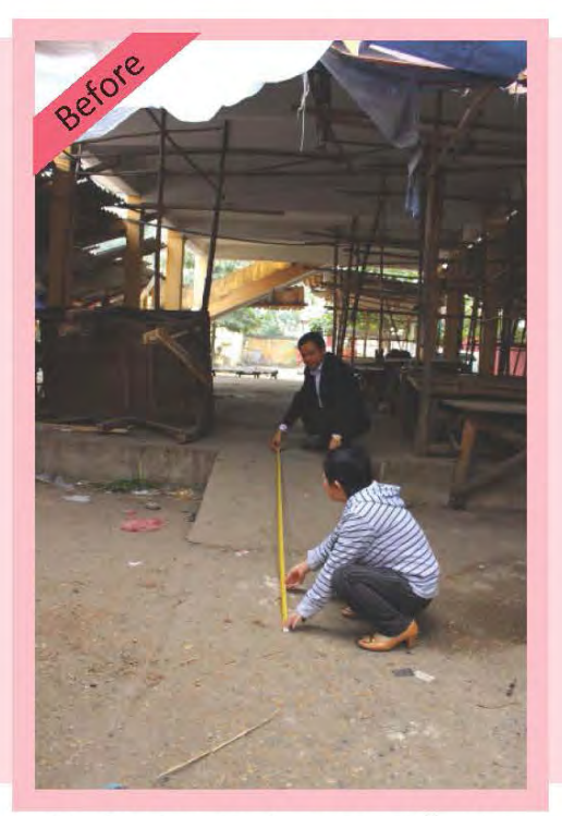
Market interior during modification