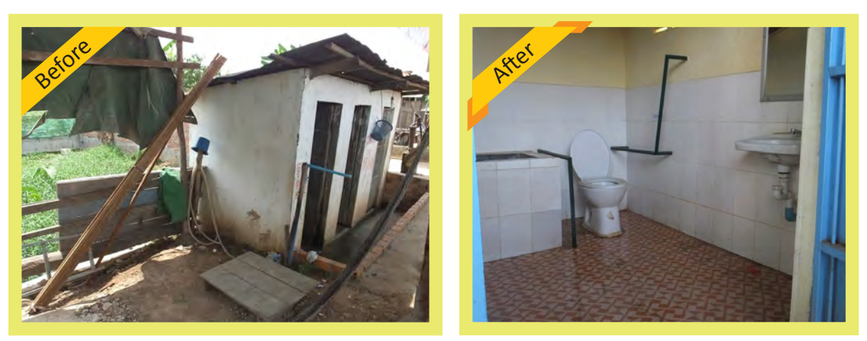
Old and new accessible toilet