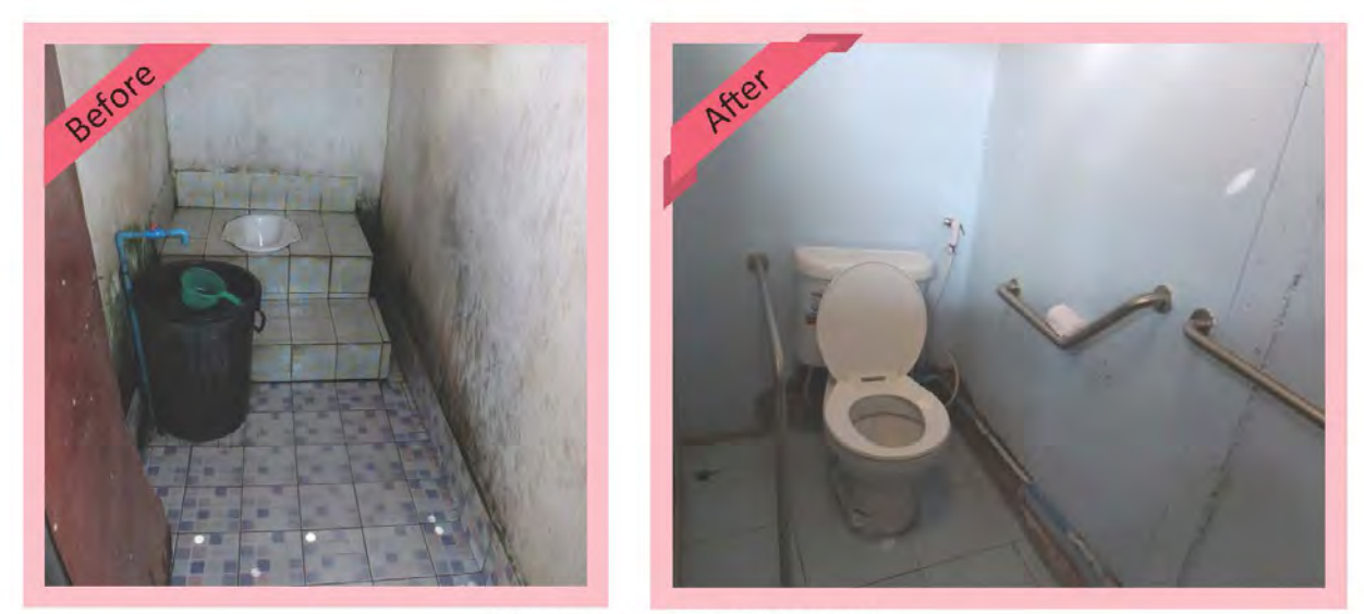
Old and new accessible toilet