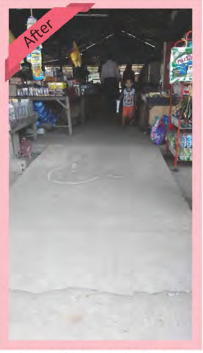
Accessible market entrance

Contact Person: Mrs. Boalaphan Pameung; Mobile: +856 20 55595215