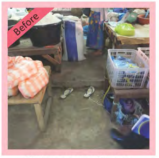
Market entrance with steps