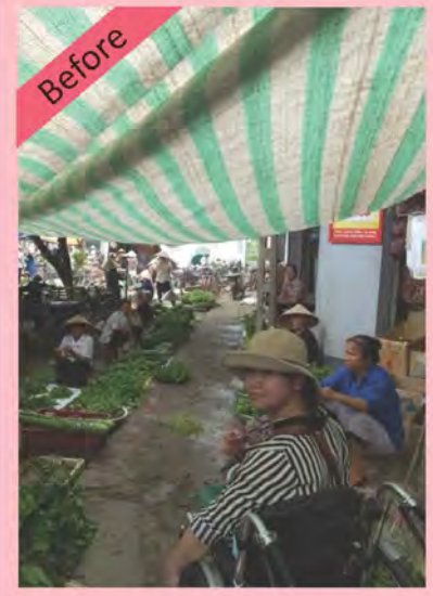
Old pathway to the toilet