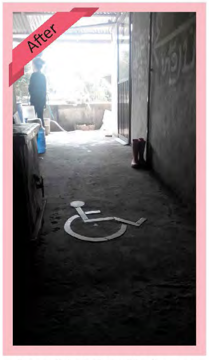
Accessible toilet with signage