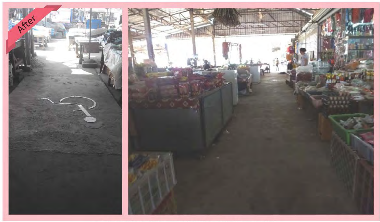
Accessible entrance and pathway in the market