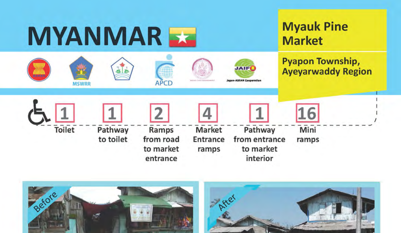
Market entrances old and new