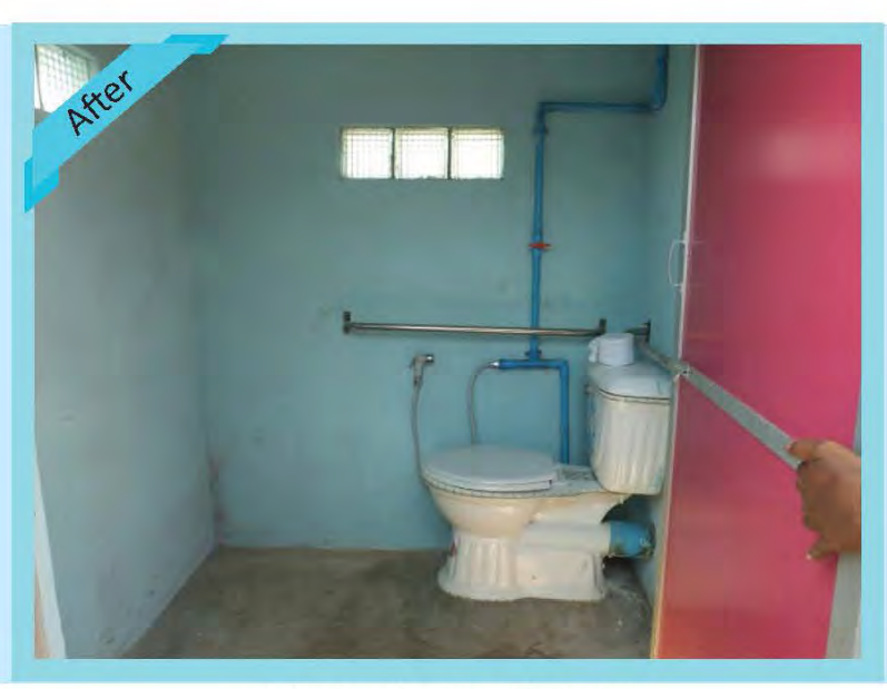
Interior of accessible toilet