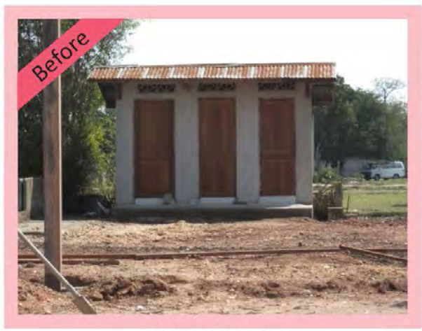
Old public toilet