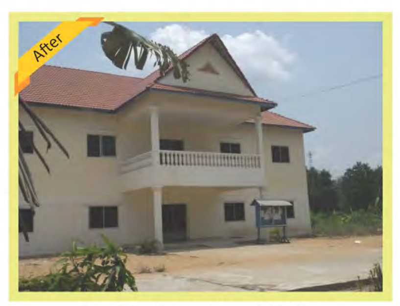
Accessible entrance at the District Office