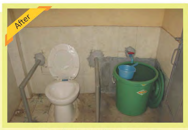
Toilet in the District Office Training Hall