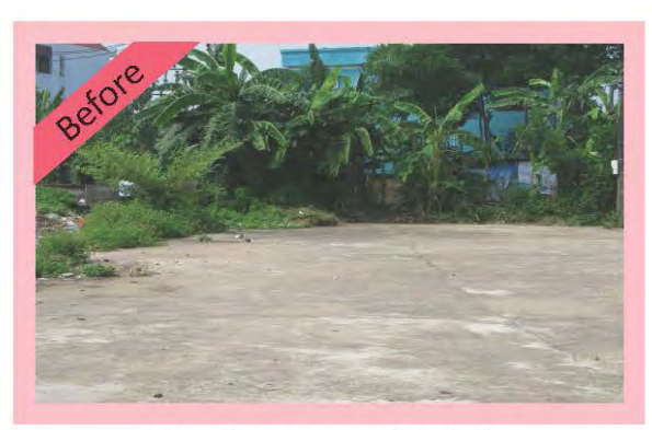
Site of new accessible toilet