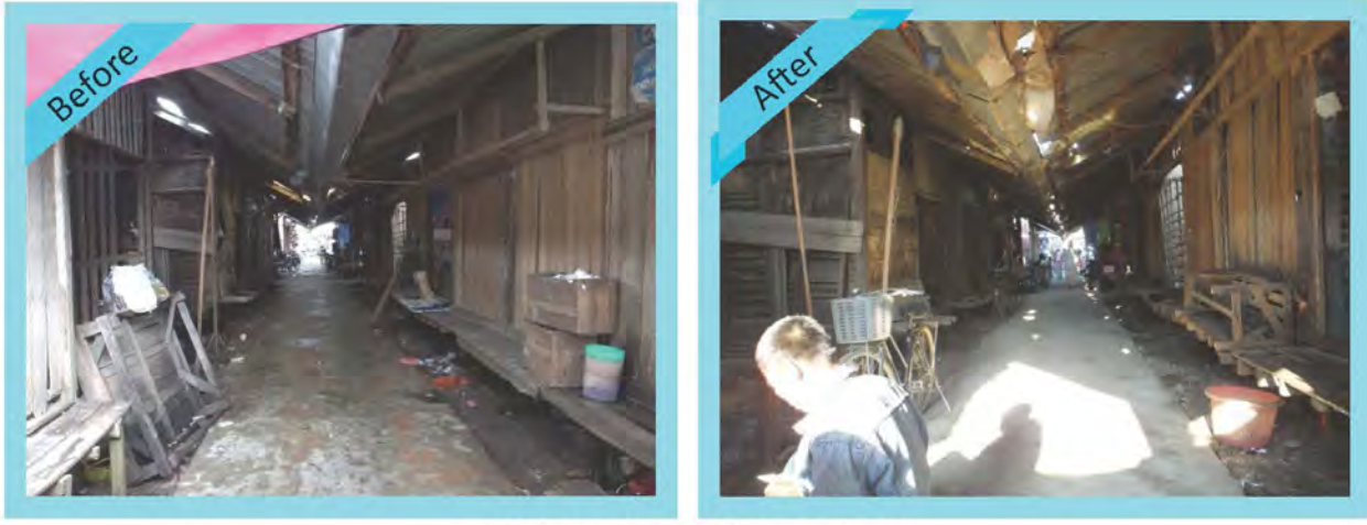
Market pathways then and now

Contact Person: Mr. Zay Ya Ohn; Mobile: +856 20 55508640; +856 30 5367493