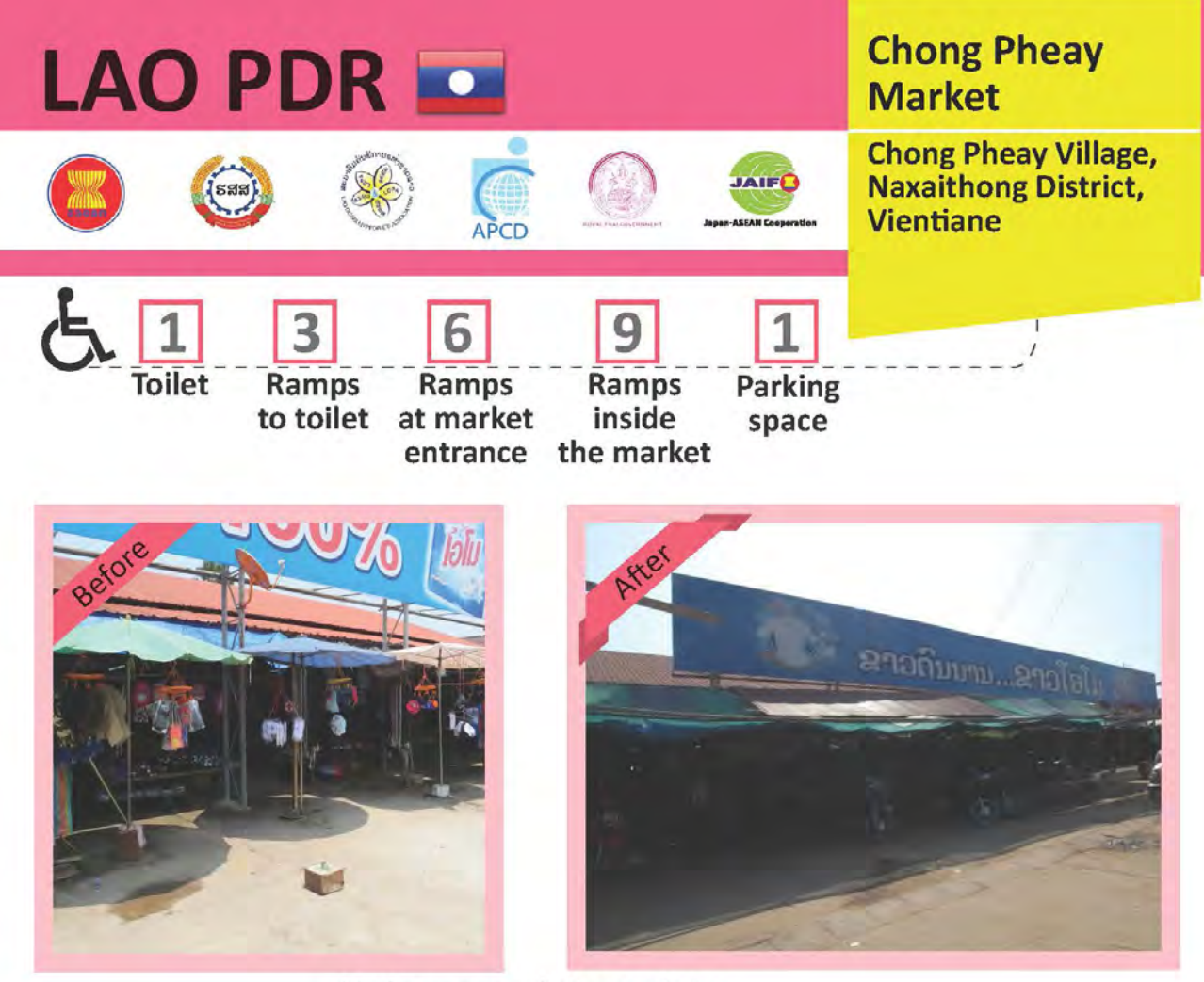
Market entrance before and after