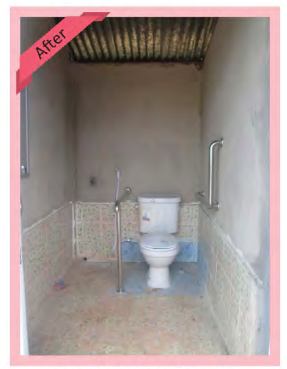
Accessible toilet in the market