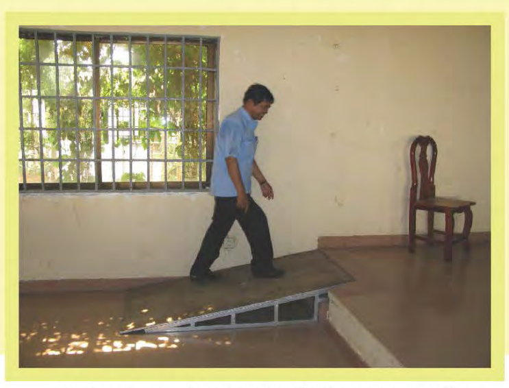
Ramp going to the stage inside the Training Hall