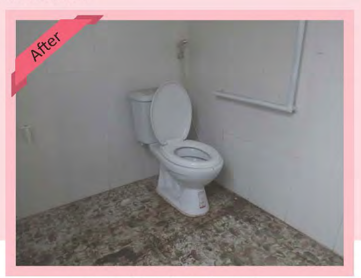
Accessible toilet in the market