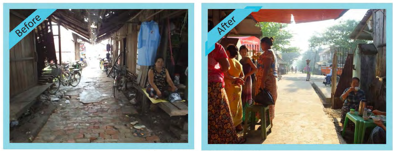
Old and new market pathways