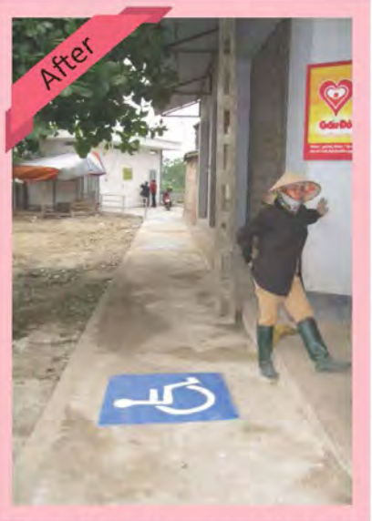
New pathway to accessible toilet

Contact Person: Mr. Phung Van Hoa; Mobile: +84 912867326