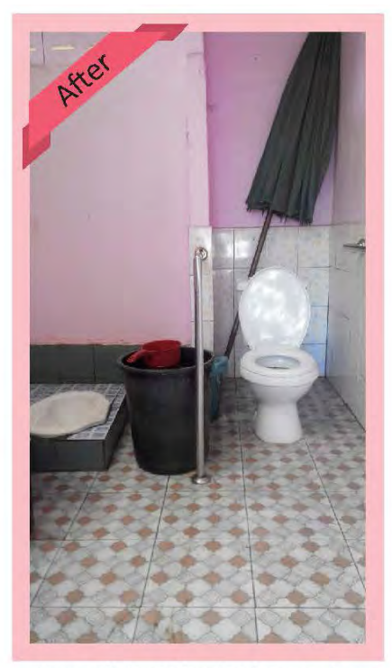
Accessible toilet in the market