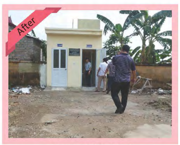
New accessible toilet