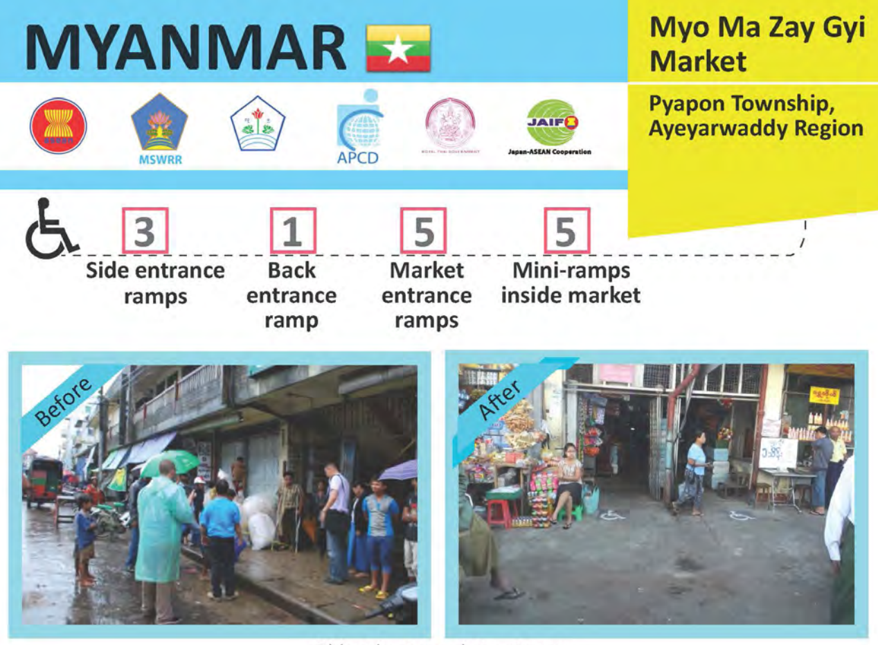
Old and new market entrance