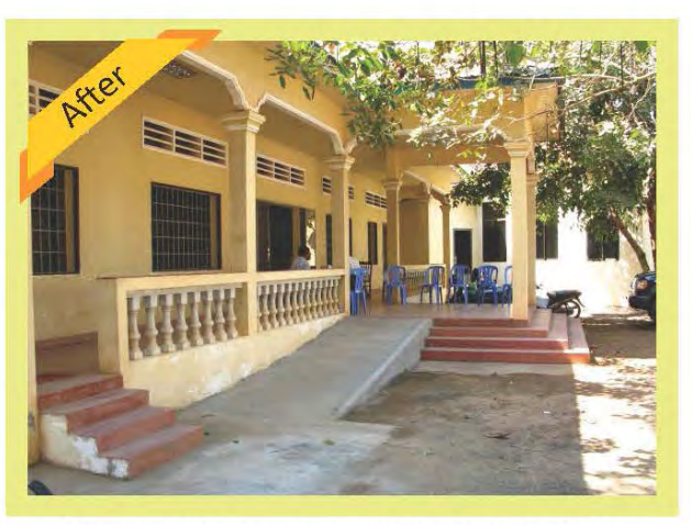
Ramp at the entrance of the Training Hall