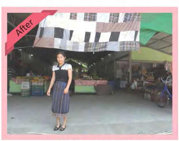
Modified market entrance

Contact Person: Mrs. Maikam Srithala; Mobile: +856 20 56777134