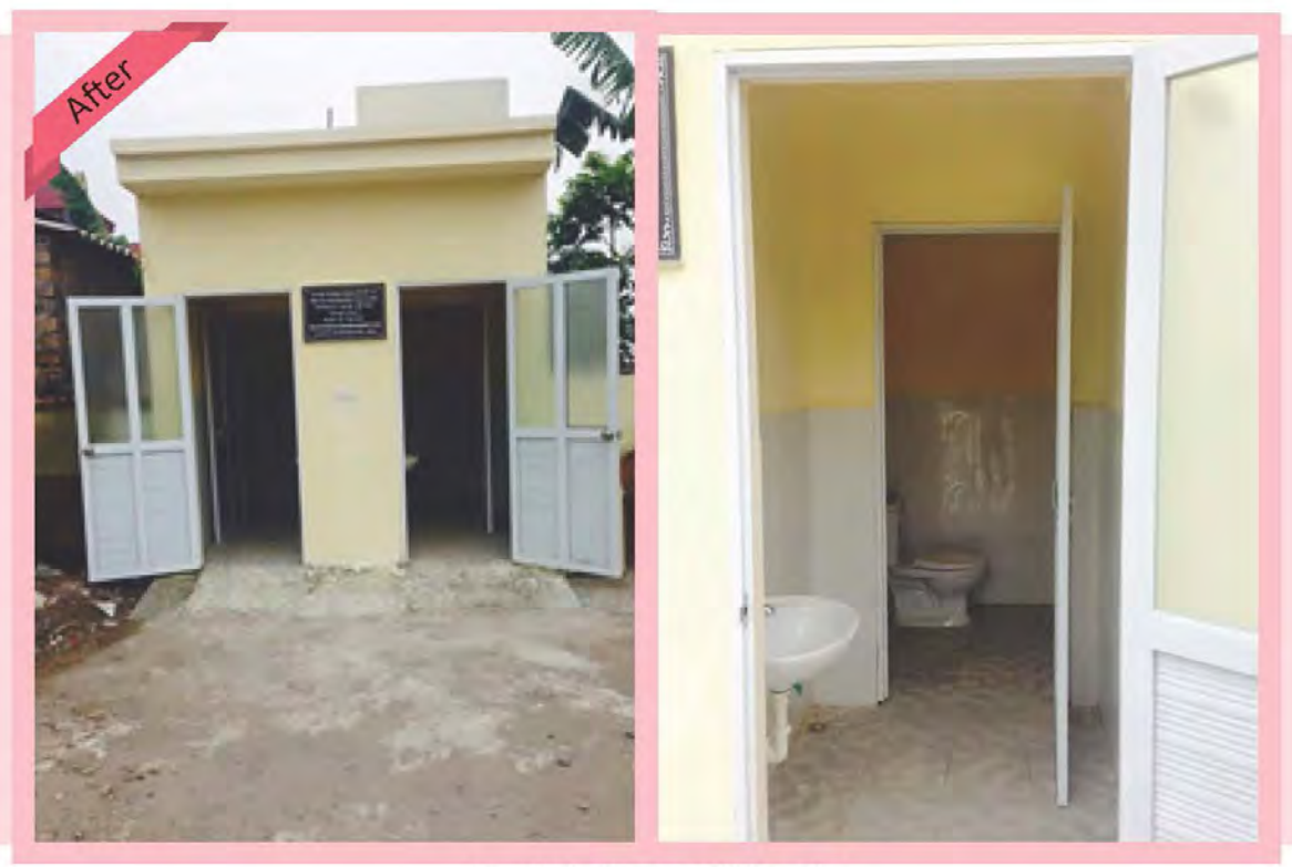
Newly built accessible toilet