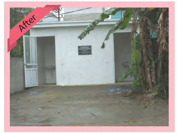
Accessible toilet in the market