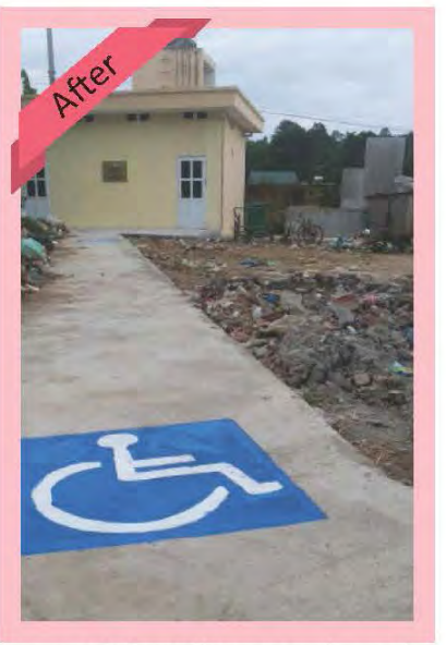
Accessible pathway to the toilet