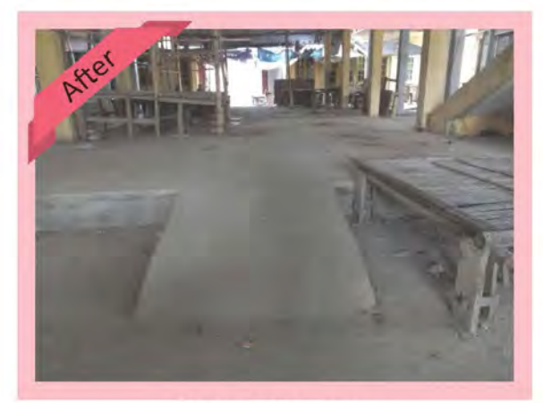
New market ramp