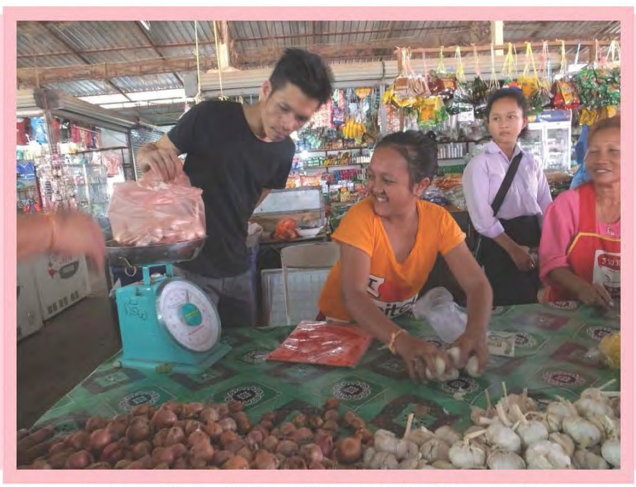
Person with disabilities selling vegetables in the market