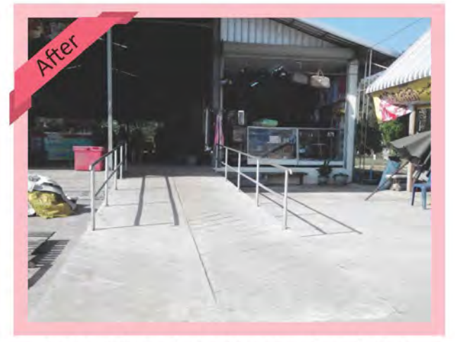
Accessible market entrance with grab bars