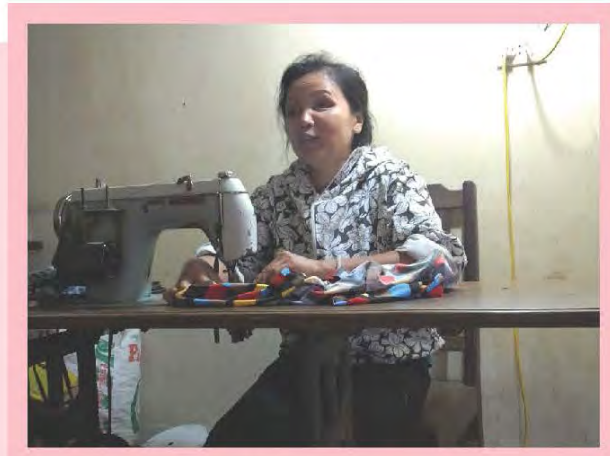
Persons with disabilities providing services/products in the market