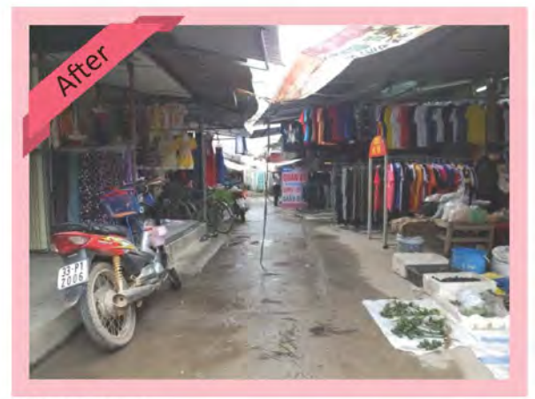
Market pathways old and new

Contact Person: Mr. Phung Van Dau; Mobile: +84 903206281