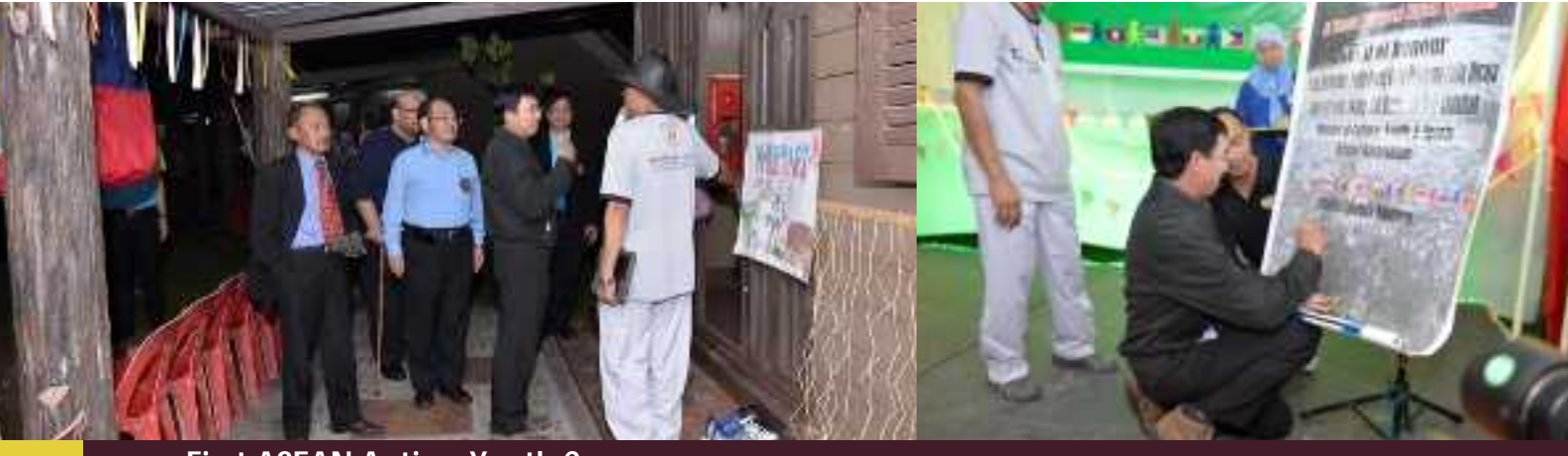
First ASEAN Autism Youth Camp