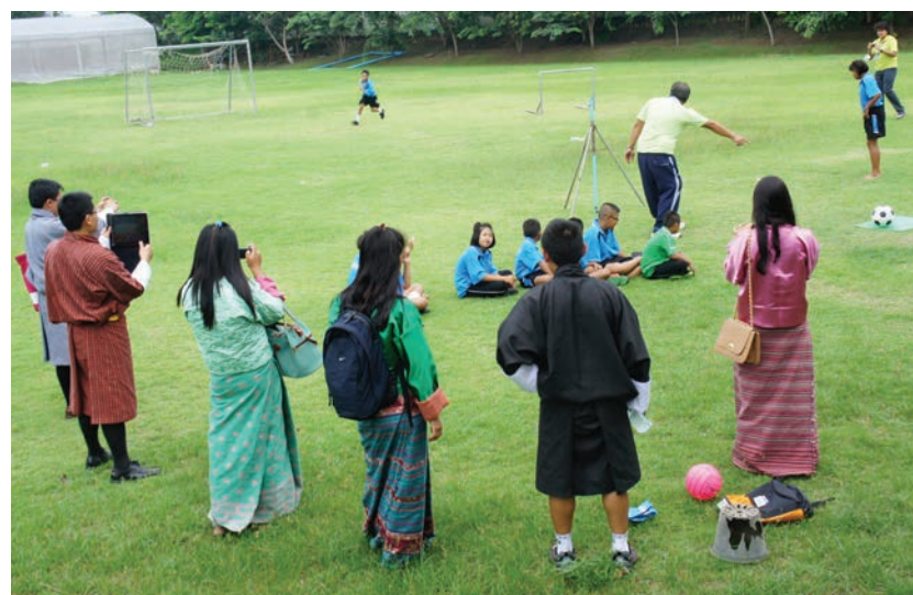
• Field Trip to Lopburi Panyanukul Special School and Observing Activities