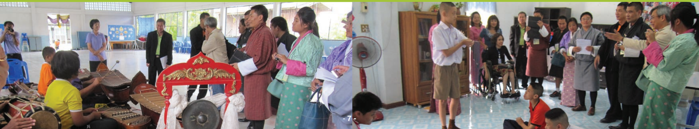
• Field Visit to Polrom Anusorn Mittrapab 50 School