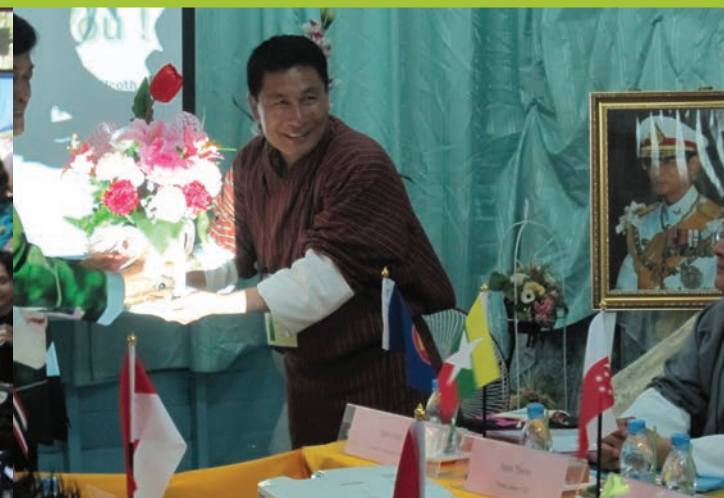
• Field Visit to Wat Takien School