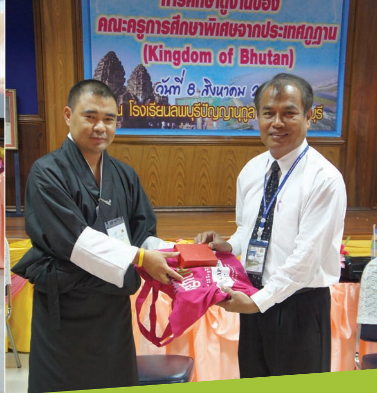
• Appreciation for Field Trip to Lopburi Panyanukul Special School and Presentation and Discussion at Lopburi Panyanukun Special School