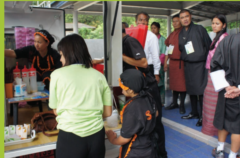
• Observation on Income Generation Activities