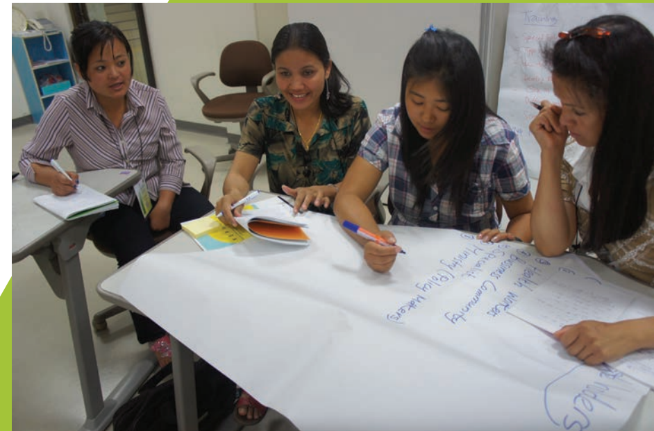
• Discussion between Participants

Upon the completion of the training, one of the significant successes is the intensified collaborations and cooperation between APCD and Bhutanese participants. This fusion of forces has potentially created greater strength and a universal platform to promote equally educational opportunities and sustainable development. The five-day training was concentrated but productive, numbers of output were agreed upon further engagement and continued collaboration among the participants and APCD. In the evaluation, participants noted the importance and the relevance of the training for their needs and would consider having further in-depth training in the future on Community-based Inclusive Education and the application of mainstream issues into policy and human resource development programs.