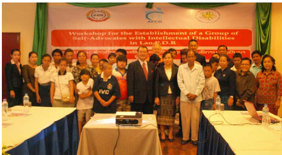
Group Photo among Participants

Thirty-five workshop participants were fruitfully accomplished the goal of the one-day workshop for the ‘Establishment of a Group of Self-Advocates with Intellectual Disabilities in Lao PDR’, that was intended to form the first Self-Advocate Group with Intellectual Disabilities in Lao PDR, and to promote collaboration among five countries (Lao PDR, Cambodia, Myanmar, Thailand and Vietnam).