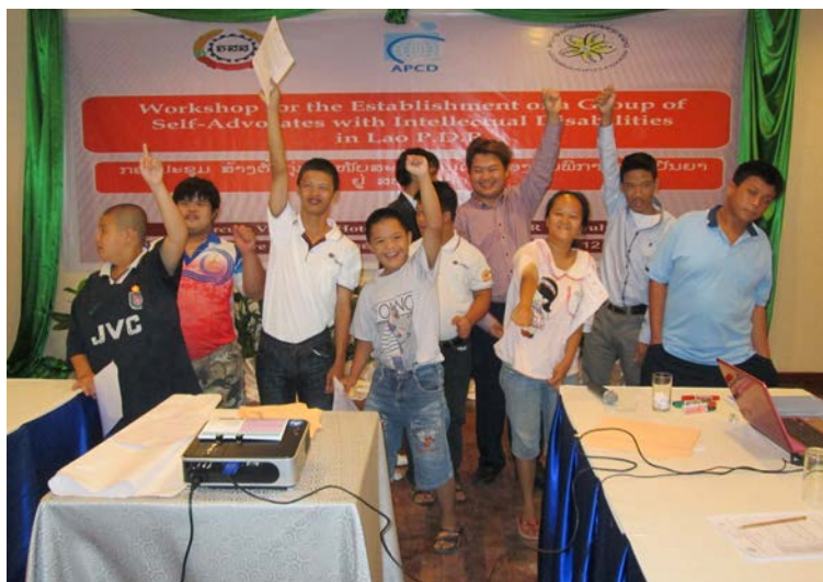
"Talent Group" the First Self-Advocates Group with Intellectual Disabilities in Lao PDR