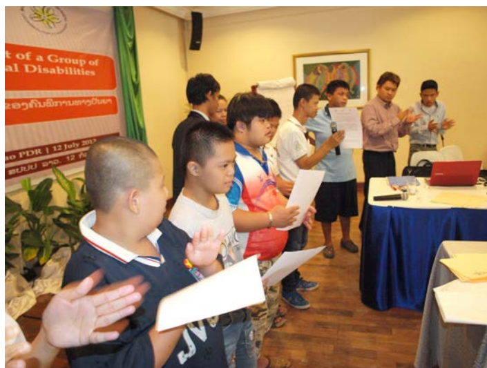
Group Reading of the Vientiane Recommendations by Members of the Talent Group