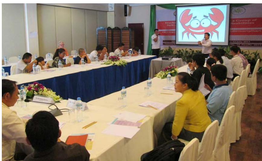
A Discussion on Process to Establish a Group of Persons with Intellectual Disabilities

Recently, self-advocacy groups have started to gain confidence in themselves. They learn the tools and experiences to take greater control over their lives, and how to make decisions and choices that affect their lives so they can be more independent. As a result, an increasing number of Self-Advocates have taken charge of their lives and began fighting discrimination in society.