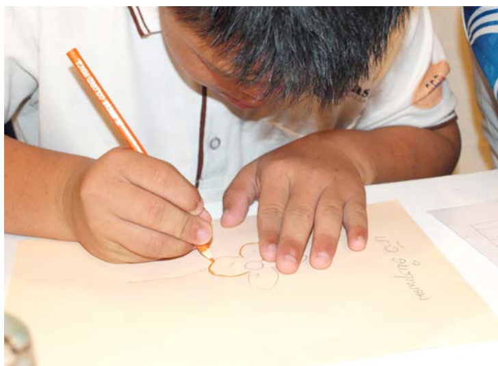
A Drawing of the Logo for the Talent Group