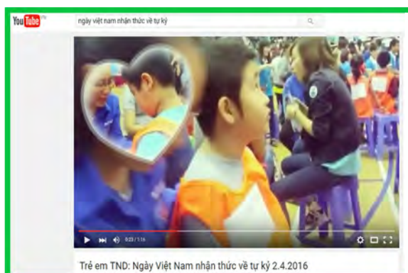
1st Viet Nam Autism Awareness Day: Memories https://www.youtube.com/watch?v=2R8rnP7pGFk