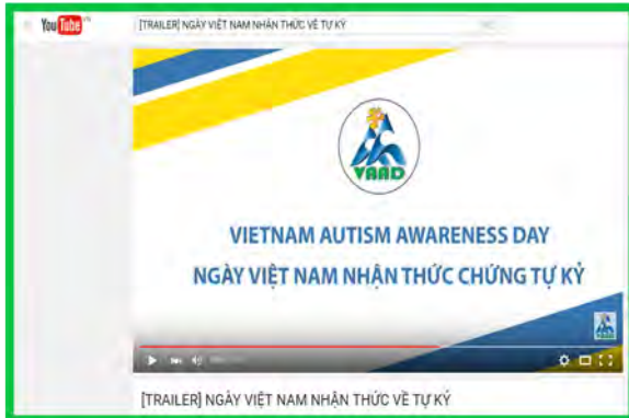
Trailer: 1st Viet Nam Autism Awareness Day https://www.youtube.com/watch?v=G4-lgk6N2GI