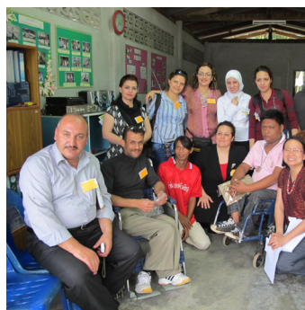
Community Learning Center (CLC): Natural Fabric Cloth Dying