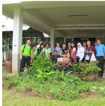
Nakornsithammarat Vocational Rehabilitation Center