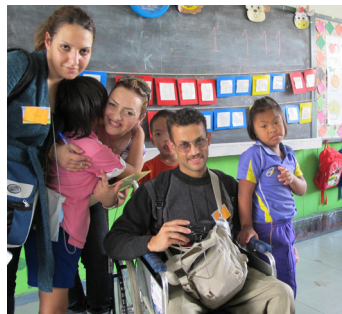
Nakornsithammarat Special Education Center