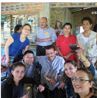
Woodcarving and Shadow Playing Making