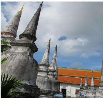
Side trip: Visit Wat Phra Maha That Woramaha Wihan