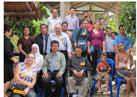
Toys for Children with Disabilities Center