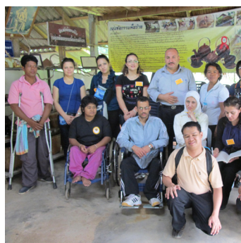
KireeWong Handicraft Group