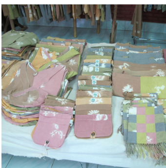
Kireewong Natural Fabric Cloth Dying