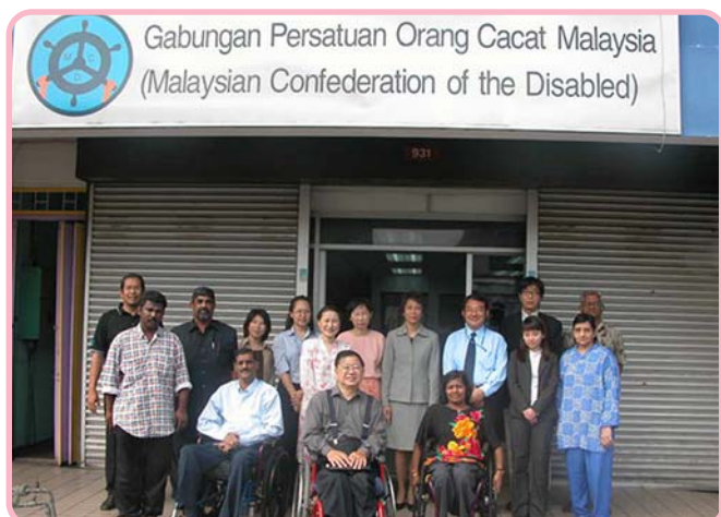
APCD team with members of the Malaysian Confederation of the Disabled.