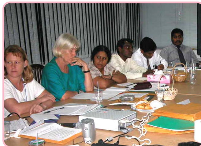
Participants from VSO : Sri Lanka

The APCD Director opened the workshop and gave an overview of APCD's mission. The coordinator of the LINKS program, a network program between Governmental and Non-Governmental Organizations that is working on CBR in Sri Lanka, shared the objectives and activities of their program and the situation of CBR in Sri Lanka.