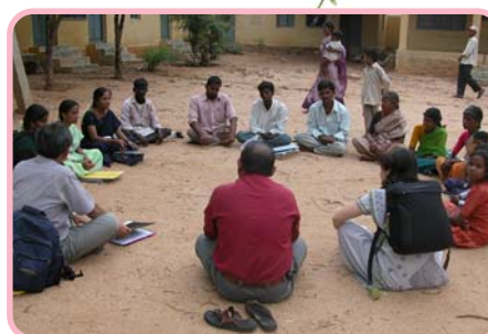
Field Survey in India

APCD deals with disability and development issues, some of which are common to various developing countries but some of which are very specific to a country due to its socio-economic condition, etc. This Mission provided a great opportunity for the APCD HRD personnel to comprehensively understand the socio-economic background of the training participants. Through relevant field surveys, the APCD HRD personnel are able to deepen their insights, which will contribute to further development of effective HRD strategies.