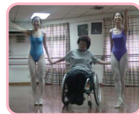
Wai Kuen Dance Studio

APCD had a mission to Kuala Lumpur, Malaysia from 8-12 June 2004 to build a network and collaborate with disability-related governmental and non-governmental organizations. This mission included the Human Resources Development (Training Implementation) follow-up mission with former APCD trainees.