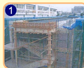
APCD's Administrative Building