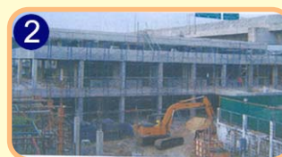
APCD's Training & Accommodation Building