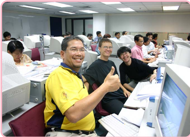
The APCD Regional Workshop on Accessible Web-based Information Networking held from 22 June to 9 July. (Details will be provided in Volume 9.)