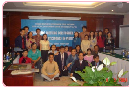
Networking Meeting in Viet Nam

organize relevant activities in their countries in cooperation with APCD.