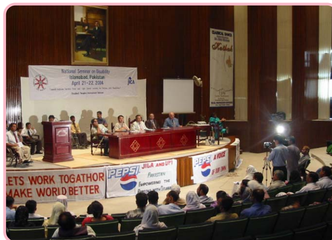
National Seminar on Disability at the National Library

This seminar, "Towards an Inclusive, Barrier-free, and Rights-based Society for Persons with Disabilities" was organized by Disabled Peoples' International Pakistan in collaboration with the Japan International Cooperation Agency, Pakistan. It provided participants with an opportunity to build up individual and organizational capacities in order to promote and achieve equality and full participation for persons with disabilities, with an emphasis on their integration as implementers and community development workers in relevant national development efforts.