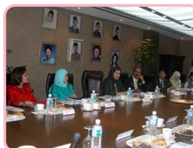
Minister and Officers of the Ministry of Women, Family and Community Development

The APCD team was most honored to meet with the Honorable Dato' Seri Shahrizat Abdul Jali, Minister of the Ministry of Women, Family, and Community Development and high-level officials on disability-concerned issues, of whom all showed interest towards APCD's activities promoting a barrier-free society and empowerment for persons with disabilities. The team visited various organizations, such as the Rehabilitation Services Division under the Department of Social Welfare, Ministry of Women, Family, and Community Development, which acts as the National Coordinating Council on Disability in Malaysia; they also visited the Bangi Industrial Training and Rehabilitation Center which provides comprehensive facilities and services for physically disabled persons to enable them to receive medical rehabilitation and vocational training to increase their ability to work. This Center also includes training for medical professions in the field. Other meetings were with related organizations and the City Hall of Kuala Lumpur promoting a non-handicapping