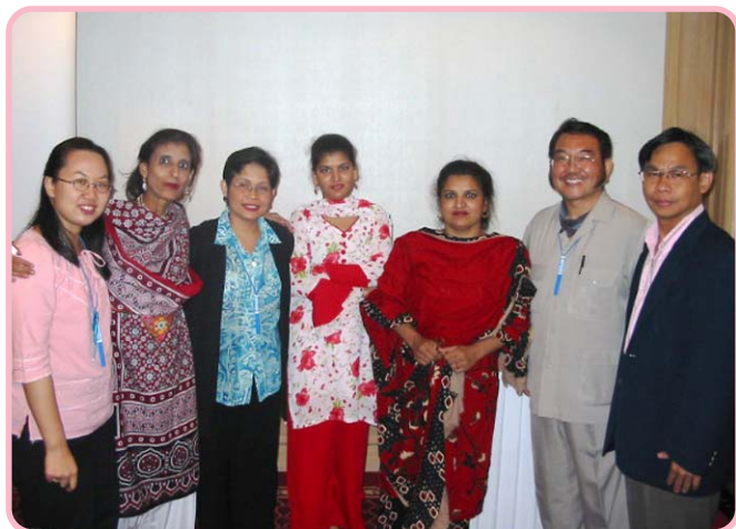
APCD Team with representatives of organizations for PWDs in Karachi

Visually Handicapped Children, National Institute of Hearing Handicapped, Pakistan Foundation for Fighting Blindness, Al-Maktoom Special Education Center for Visually Impaired Children, Darkshan School for the Blind Girls (Rawalpindi), Hostel for Hearing Impaired Children, and the Sir Syed Deaf Association. In addition, the mission joined the National Seminar on Disability in Islamabad organized by Disabled Peoples' International (DPI) – Pakistan from 21 to 22 April 2004 to present the activities of APCD. During the Seminar, the APCD Information Support team exchanged information