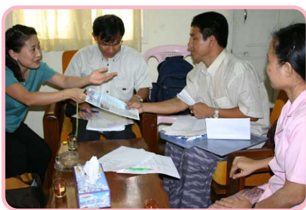
Myanmar Former Deaf Trainee

Most participants who were interviewed continue to have a commitment and are active in the field of APCD training. Some outstanding participants had initiated relevant activities utilizing the knowledge and skills obtained through APCD's training courses, and played an important role in their domestic training, organizational development, policy advocacy, etc. at the district, provincial, and national levels.