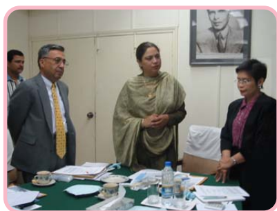
H.E. Mrs. Nilofer Bakhtiar, Adviser to the Prime Minister, Ministry of Women Development, Social Welfare and Special Education

The Asia-Pacific Development Center on Disability (APCD) sent a mission to Karachi, Islamabad, and Lahore, Pakistan from 17-23 April 2004. In Karachi, the mission had a network meeting with 8 organizations for persons with disabilities to exchange disability-related information and each organizations' activities with APCD.