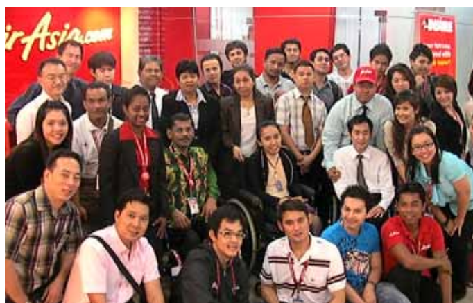
Group Photo by All Training Participants