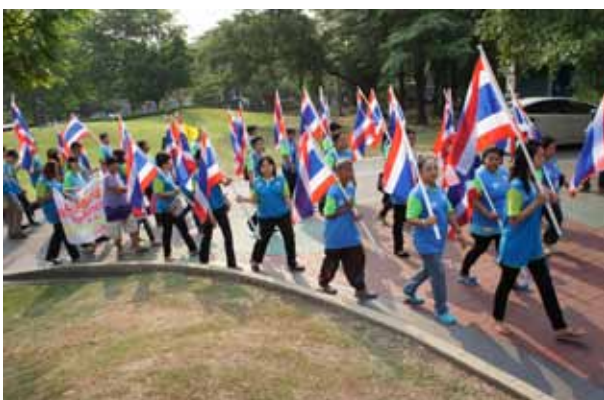
Walk Campaign in Thailand