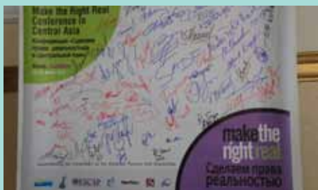
Signing the Pledge Board to Support “Make the Right Real”

The “Make the Right Real Conference in Central Asia and the CIS countries” was organized by the Government of Kazakhstan through the Ministry of Labor and Social Protection of Kazakhstan and the Commissioner for Human Rights (Ombudsman) of Kazakhstan, in collaboration with the Disabled Women Association (SHYRAK) of Kazakhstan, the United Nations Economic and Social Commission for Asia and the Pacific (ESCAP), the Asia-Pacific Development Center on Disability (APCD), the KYNYS Association, the Soros Foundation of Kazakhstan, and the Japan International Cooperation Agency (JICA), from 29 to 30 March 2012, in Almaty, Kazakhstan. The Conference focused on “International Experiences in Realization of Rights of Persons with Disabilities and Promotion of Gender Equality”.