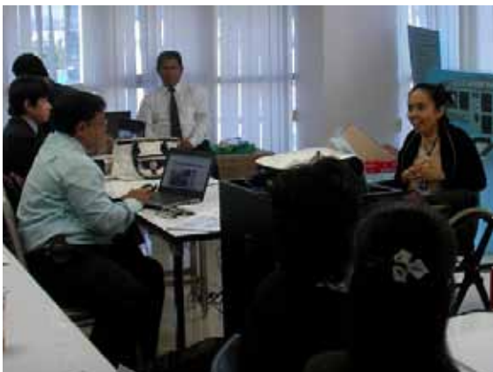
Contents Provided by Thai Resource Persons

Furthermore, monthly training schedule is being developed to extend DET&DRST to other Thai Air Asia staff for an inclusive barrier free society through its airline services.