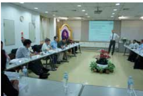
Outlining the Future Direction of “Disability-Inclusive Business”

In line with the principles of the United Nations Convention on the Rights of Persons with Disabilities (CRPD), participants emphasized how to promote disability-inclusive business since it can refer to reasonable access to goods and services, to ensure, wherever possible, persons with disabilities are represented in their companies as customers, employees, employers and entrepreneurs. It is expected that “disability-inclusive business” is going to be implemented as a tangible topic in the proposed new Asian and Pacific “Make the Right Real” Decade for Persons with Disabilities (2013-2022).