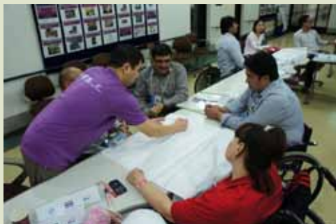
Group Work During Training

In collaboration with the Japan International Cooperation Agency, APCD organized the 11-day international intensive training course, “Inclusive for All: Training of Trainers (ToT) for the Community-based Inclusive Development (CBID)” at APCD Training Building from 6 to 17 February 2012.