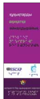
Make the Right Real Roll-up in Russian Language