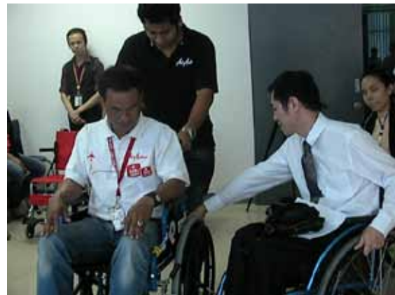
Air Asia Staff Using the Wheelchair