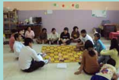
First Meeting by Rose Group

With support from the Komar Pikar Foundation (KPF), the first meeting of Rose group was organized on 31 January 2012 at NBIC. The activities and experiences of Rose group were shared with parents of persons with intellectual disabilities.