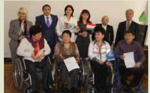
Executive Committee Members of the Central Asian Disability Forum

The participants included the representatives of Disabled People’s Organizations and other partners from Kazakhstan, Kyrgyzstan, Tajikistan, Turkmenistan and Uzbekistan. After discussing and confirming the Constitution of the Central Asian Disability Forum (CADF), the Chairperson and other Executive Committee members were elected to lead the initiative. The Government of Kazakhstan expressed their support to the Central Asian Disability Forum which could be one engine to improve the quality of life of persons with disabilities.