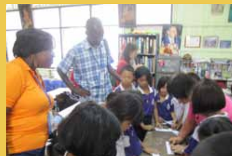
World Vision Staff Visiting Field Practices