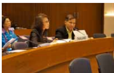
Thai Government Representatives Sharing Their View

By the end of June 2012, the reviewed Incheon Strategy is going to be available for a reference at the intergovernmental high level meeting in Incheon, South Korea.