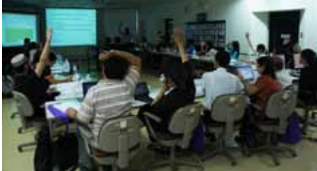
Participants Sharing the Perspectives of Hard of Hearing and Deafened

For the first time in the history, the “Asia-Pacific Regional Workshop on Hard of Hearing and Deafened” was organized jointly by Danishkadah (Pakistan), Center for Research and Education of the Deaf and Hard of Hearing (CED) (Vietnam), Asia-Pacific Development Center on Disability (APCD) and Japan International Cooperation Agency (JICA), at APCD Training Building from 29 February to 2 March 2012.