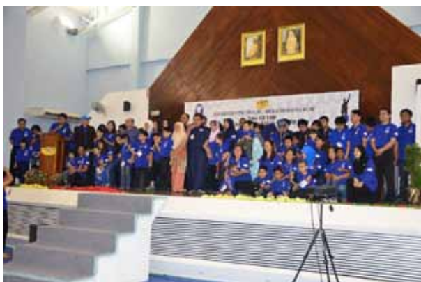
Group Photo of Organizing Team and Family Members in Brunei

The World Autism Awareness Day (WAAD), 2 April, is one of the most breathtaking autism celebrated events every year. On 2 April 2012, streets, parks, national monuments and shopping centers in several major cities in the member countries of AAN were venues to organize the important activity. Persons with Autism and their family members, Government representatives, NGOs workers, business partners, volunteers, students and community members actively participated in this powerful activity. National TV and newspaper of each AAN members' countries reported on this event. Each mile has embraced an inspiration on action on autism awareness. This milestone has provided continued support and courage towards a friendly autism awareness society in the ASEAN region.