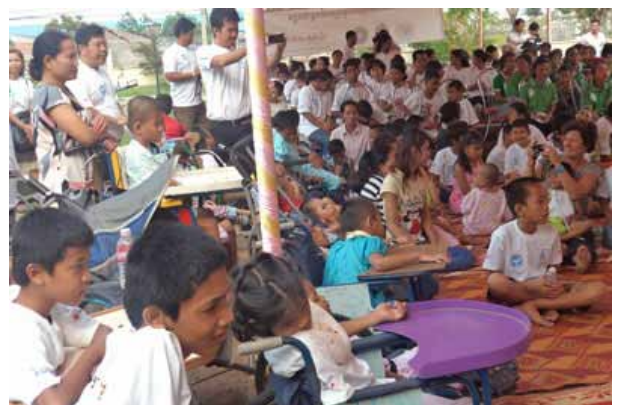
Children Participating in the Event in Cambodia