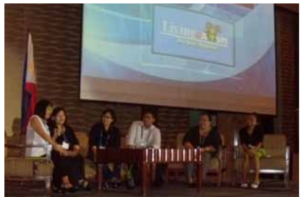
Panel Discussion on Lesson Learned in the Philippines