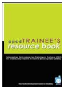
APCD Trainee’s Resource Book.