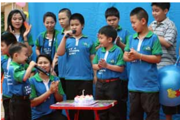
Music Performance in Lao PDR