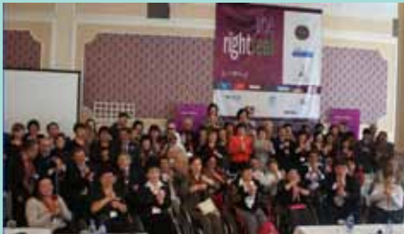
“Make the Right Real” in Local Sign Language