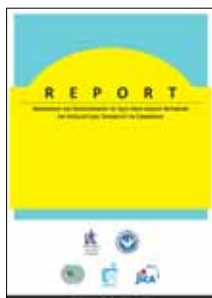
Report on Workshop on Intellectual Disability in Cambodia