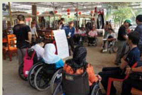
Field Visit in Nonthaburi Province

After the field visits at Nonthaburi Independent Living Center and Bankrang Self-help group, Nonthaburi province, participants had a chance to apply their knowledge and skills into action-plans and individualized projects during the project-based learning and simulation session.