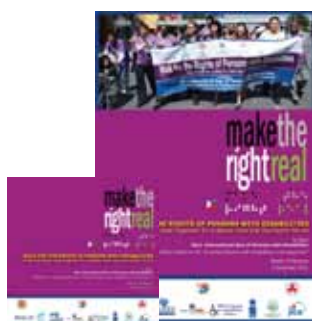
Report on International Day of Persons with Disabilities: Make the Right Real in the Philippines.