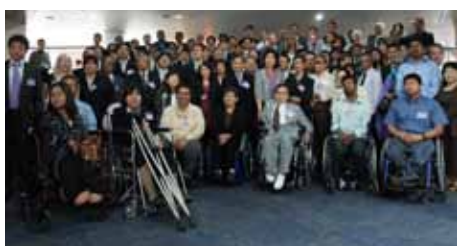
Participants of the Meeting

From 14 to 16 March 2012, the Regional Preparatory Meeting for the High-level Intergovernmental Meeting on the Final Review of the Implementation of the Asian and Pacific Decade of Disabled Persons, 2003-2012, was organized by the United Nations Economic and Social Commission for Asia and the Pacific (ESCAP).