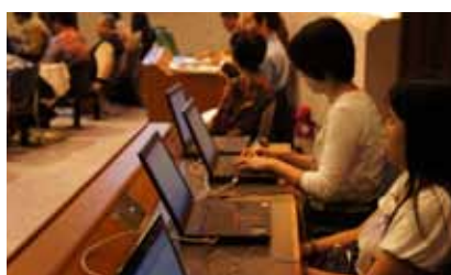
Real Time Captioning by Blind Captioners