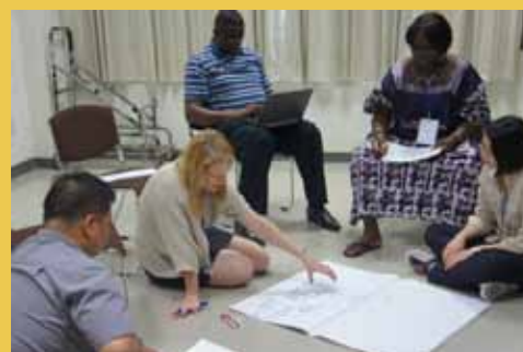
Group Work among World Vision Staff

The training concluded with fruitful and active group presentations, reflected from the discussion session on “Development of Inclusive Strategies” to be applicable in participant’s area of expertise for mainstreaming disability.