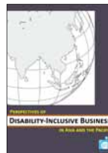
Disability-Inclusive Business Booklet