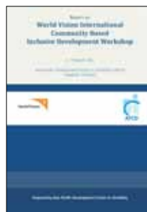
Report on World Vision International Community Based Inclusive Development Workshop