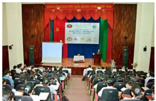
Conference in Ho Chi Minh, Vietnam for Raising Awareness on Autism