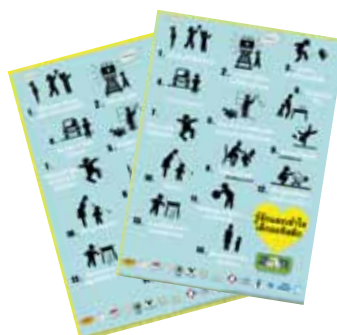
Autism Poster in Thai and in English