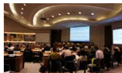
Finalizing the Meeting Report