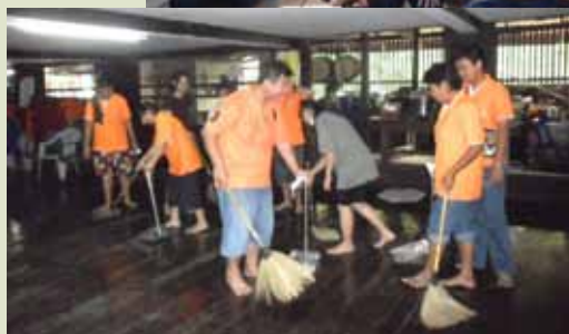
Dao Ruang Group Members Working in the Community