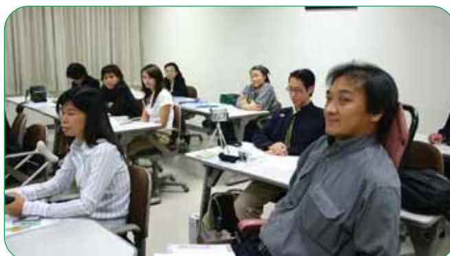
APCD's Thai Ex-trainees on Thai Follow-up Seminar

target groups in the future. As an organizer, APCD, received comments and suggestions on conducting training, follow-up, evaluation and ways to support them.