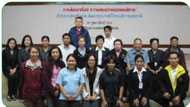
DET at TAK Province

The DET Extension Group arranged a seminar for PWDs, local authority officers, special education teachers as well as staff who are responsible for refugees and hill tribes at Mae Sot District, Mae Hong Sorn Province, in northwest Thailand. The curriculum focused on the rights of PWDs with Thailand's new Empowerment for Persons with Disabilities Act 2007.