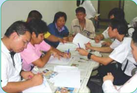
Working Group of Persons with ID

APCD organized the Regional Workshop for Networking and Collaboration on Intellectual Disabilities (ID) from 22-25 January 2008, at APCD, Bangkok, Thailand.