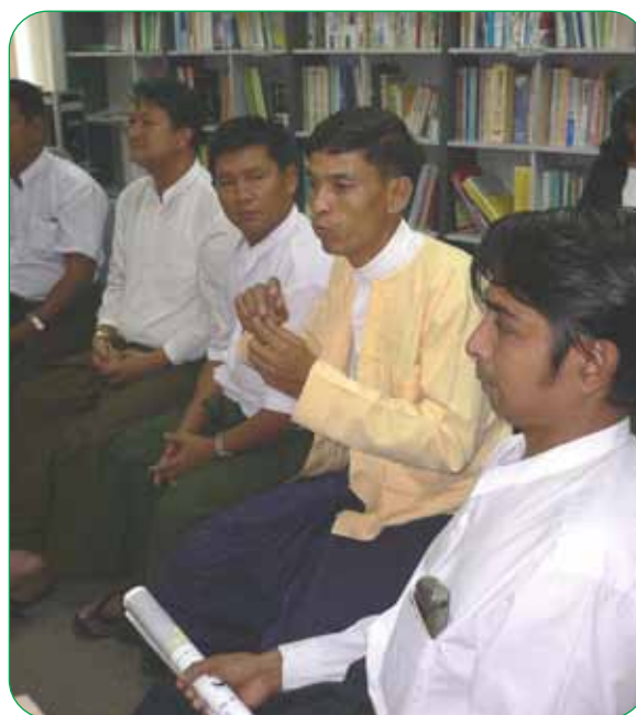
During Deaf Workshop

We realized through this workshop that the Thai resource persons were effective and had good advice for people in Thailand's neighbouring countries such as Myanmar; the climate, history, culture and social & economic situations are similar as compared to the same factors of developed countries.