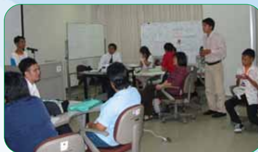
ID Boy from Cambodia Expressed his Comment During Class

Follow up and support for Networking and Collaboration on ID will be implemented and strengthened continually in the respected countries by APCD and relevant groups/ organizations.