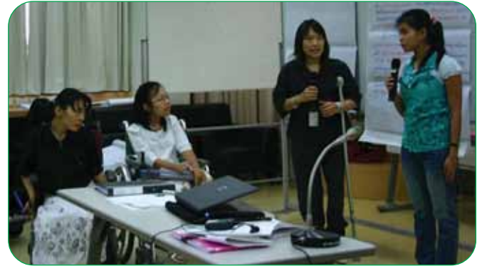
During Class on WWD Training

to visit Promoting Womens' Status Center in order to see real problems. Participants then wrote action plans for future networking.