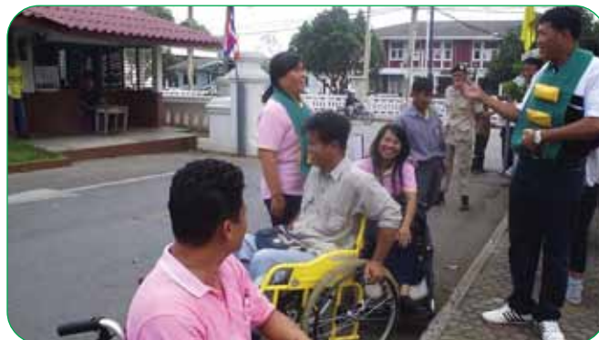
Stimulation Activities on DET at NAN Province

The contents included a correct understanding of 'Disability', the medical and social models, inclusion in society as well as a simulation activity in the city and hotel to monitor accessibility and the facilities.