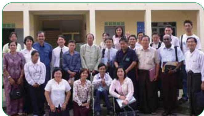
Field Visit at a School for Disabled Children and a Parents Group of Disabled Children

The mission team visited a school for disabled children and met with a Parents Group of Disabled Children and a Special Olympic Commission to discuss and exchange information on concerns such as education for children with disabilities, job opportunities, rearing methods suitable for the children and how to organize parents groups. They would like APCD to organize a workshop and/or seminar in Myanmar so that they can have more information regarding the afore-mentioned matters.