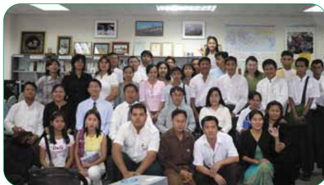
Workshop for the Deaf in Yangon

Association and another five from the Mary Chapman School for the Deaf.