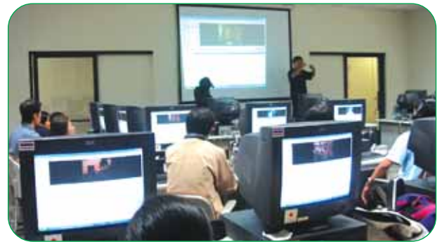
During a Session

Resource Persons from NECTEC and APCD will compile more information to adapt curriculums, contents and concepts of this training course with the intent to develop and organize a regional training course for deaf teachers and persons who are looking to the future.