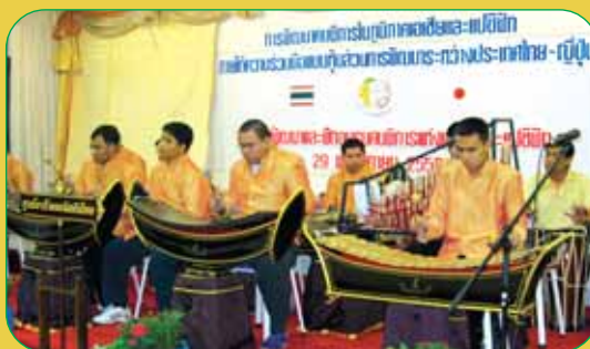
Thai Musical Show by Thai Autistic Foundation