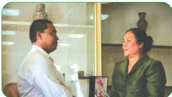
Lao Minister of Labour and Welfare and Thai Resource Persons with Autism