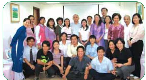
Workshop for the Deaf in HCMC

and its global networks), and C) to introduce and discuss possible future collaboration with APCD.