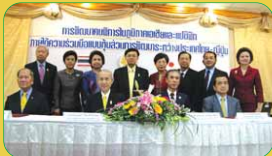
The Opening Ceremony of the Memorial Seminar on Development of Persons with Disabilities in Asia-Pacific Region