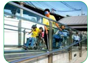
A Field Visit to the Mass Rapid Transit Authority of Thailand

Participants from Bangladesh, Indonesia, Lao PDR, the Philippines, Sri Lanka and Thailand represented architects, engineers, urban planners, public transport planners, government officials and non-governmental personnel concerned with disability issues as well as representatives of self-help organizations of persons with disabilities.