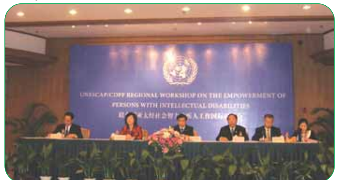
The Regional Workshop on the Empowerment of Persons with Intellectual Disabilities in Shanghai

APCD believes that the movement of persons with intellectual disabilities will be developed through effective networking and collaboration among self-advocate groups, self-help groups of parents, government organizations, non-governmental organizations and all other sectors in society at different levels.