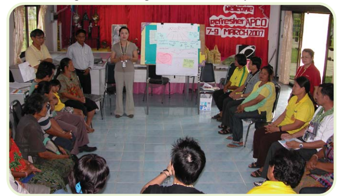
A Vietnamese Participant in the Khonkaen Field Work

Since its inception, the CBR project has involved PWD, their families and village leaders as volunteers, and their participation has become a driving force to sustain all the positive changes occurring in the community. PWD and their