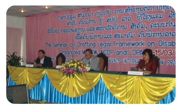
Seminar on Disability Legal Frameworks

A representative of the Ministry of Foreign Affairs from the Department of International Treaty and Legal Affairs, along with an UNDP Expert on Good Governance, expressed interest in ratifying the Convention on the Rights of Persons with Disabilities. Many questions and answers were exchanged on the Convention and the Vietnamese Government's decrees and policies on disability since the Lao PDR has a similar political and organizational situation as Viet Nam.