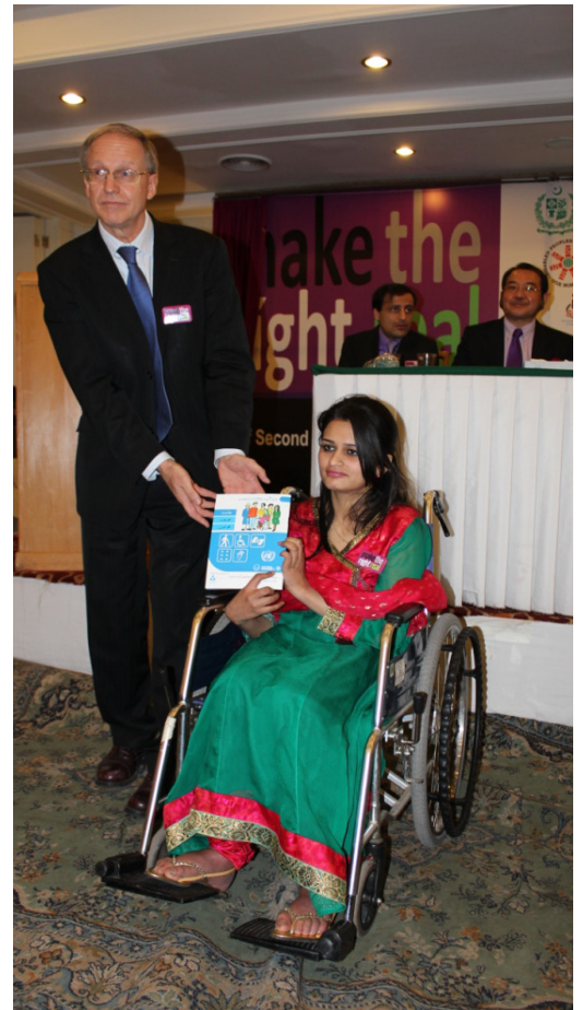
Sharing CRPD in Urdu