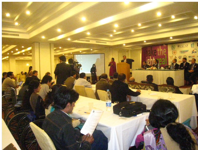
The Government of Pakistan Sharing the Commitment to the Ratification of the Convention on the Rights of Persons with Disabilities

Stakeholders' Meeting on Reviewing the Implementation of Second Asian and Pacific Decade of Disabled Persons (2003-2012) in Pakistan