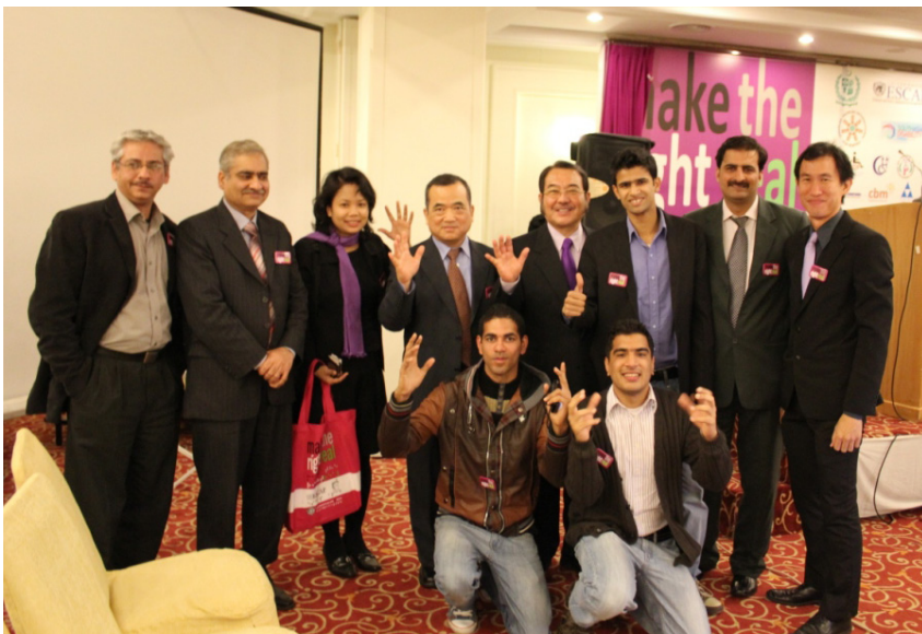
Together with Deaf Participants