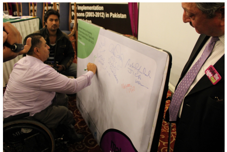
Signing on the MtRR Pledge Board