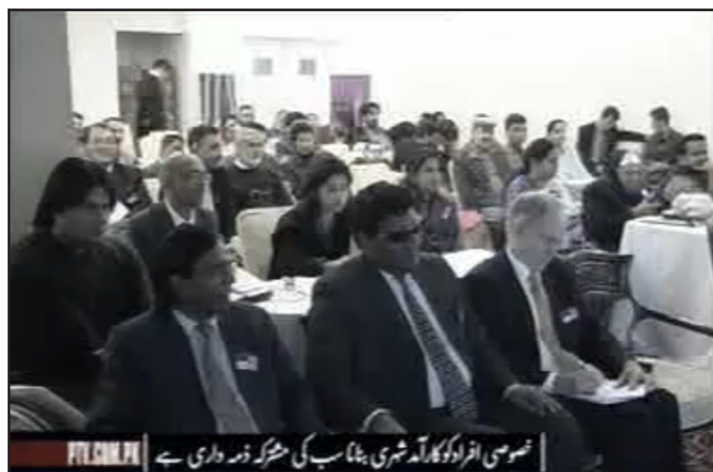
Pakistan Television, 30 January 2011 http://www.youtube.com/watch?v=TEOP-cimneo