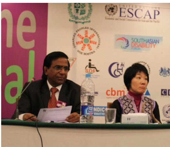
Facilitators in the Session