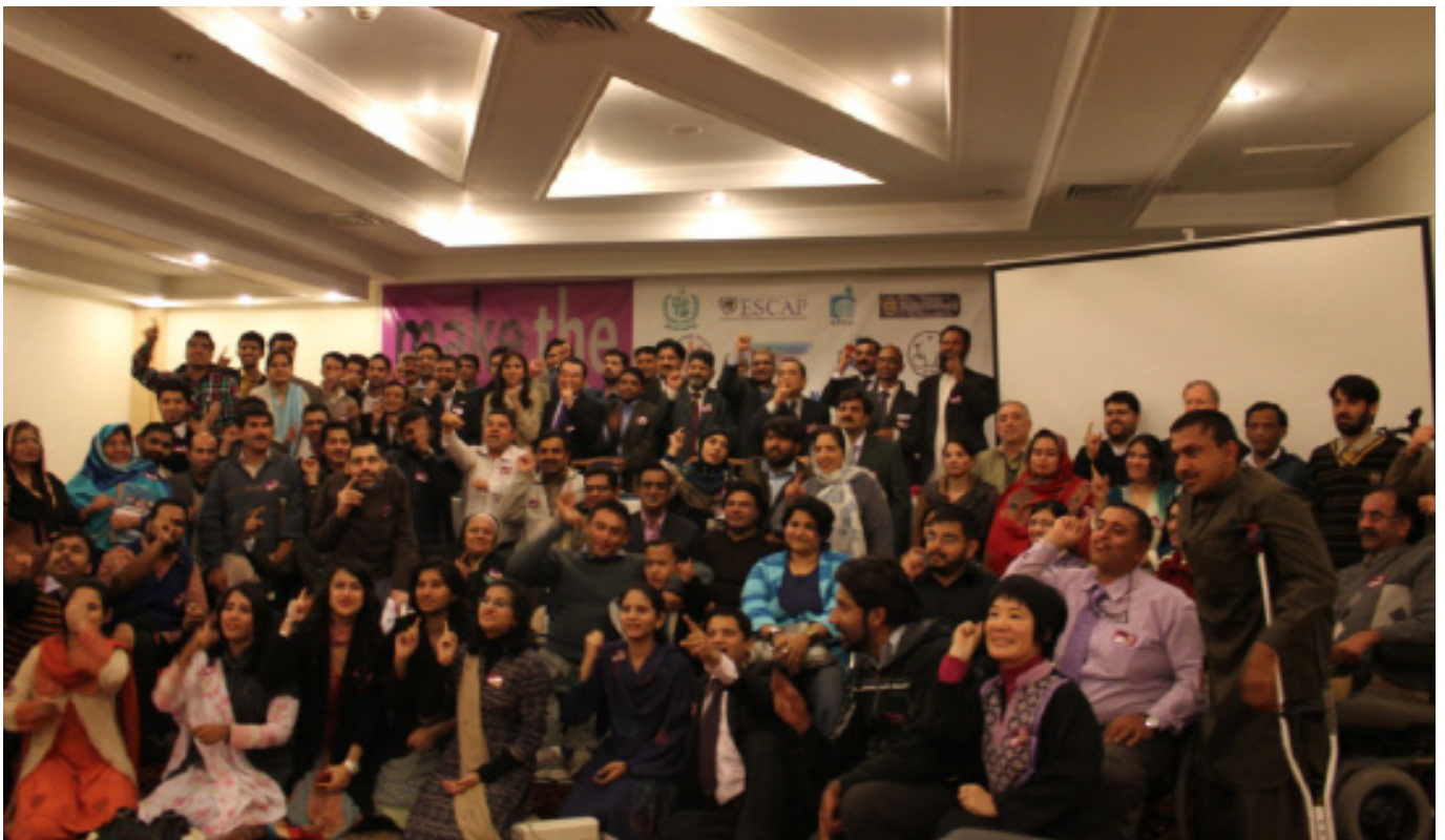
Participants Launching the "Make the Right Real" Campaign Together

After reviewing the achievement of the second Asia-Pacific Decade of Disabled Persons (2003-2012), the "Islamabad Recommendations to Make the Right Real" was adopted by participants.