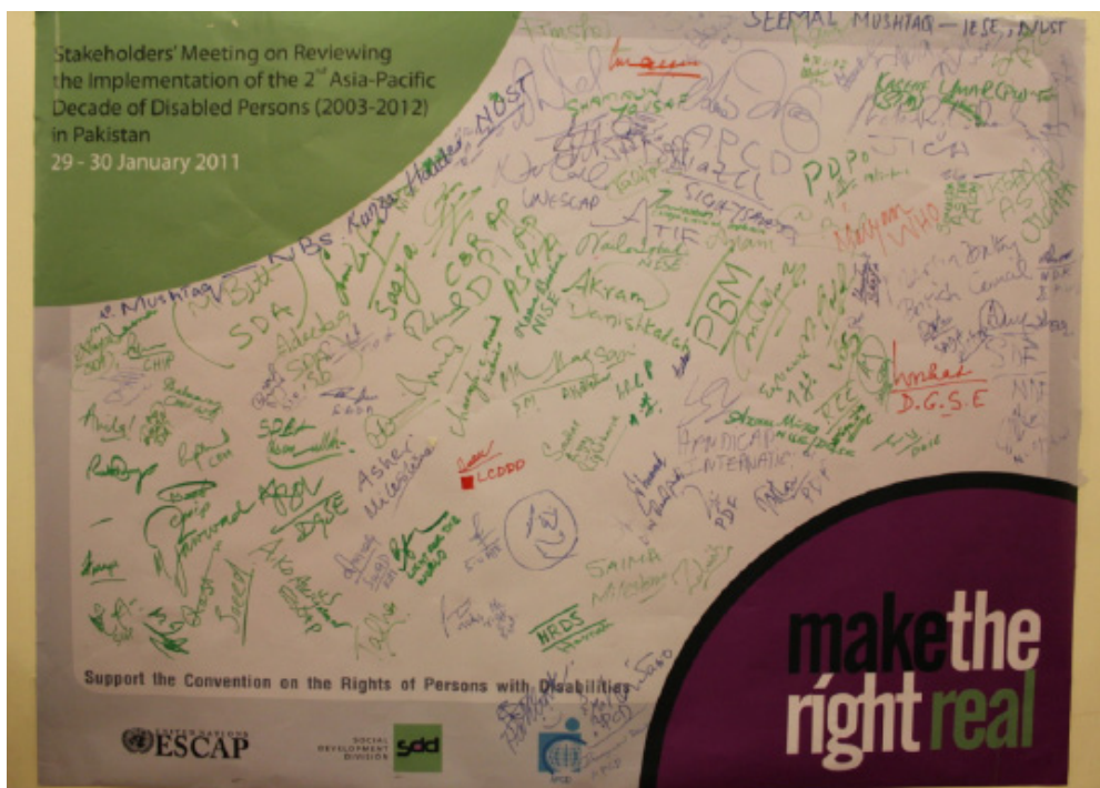
Participants Supporting the Campaign