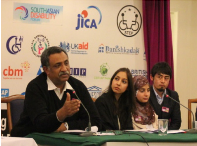
Speakers in the Session