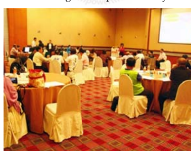
Participants sharing their inputs on the draft Incheon Strategy