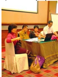
Giving feedback and incorporating voices of persons with disabilities on the draft Incheon Strategy