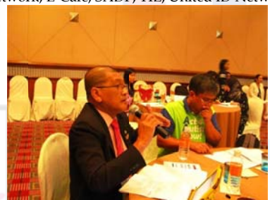
Parents group representative providing inputs from the perspective of autism