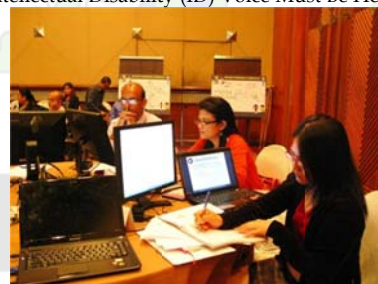
Participants who are hard of hearing and deafened checking their inputs carefully