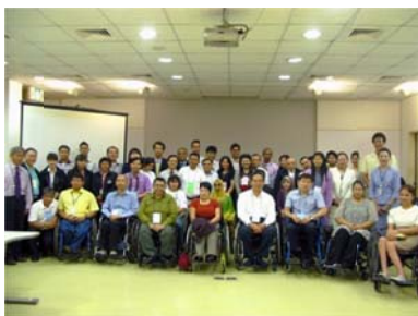
Representatives from AAN, APFHD, CADF, CBR AP Network, E-Cafe, SADF, TIL, United ID Network

This paper was developed and unanimously agreed based on voices from the participants, including emerging groups such as persons with intellectual, learning and developmental disabilities, persons with autism, persons who are hard of hearing and deafened, family advocacy groups, as well as other marginalized persons with disabilities in rural areas.