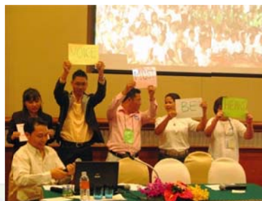
Presentation by United ID Network "Intellectual Disability (ID) Voice Must Be Heard"